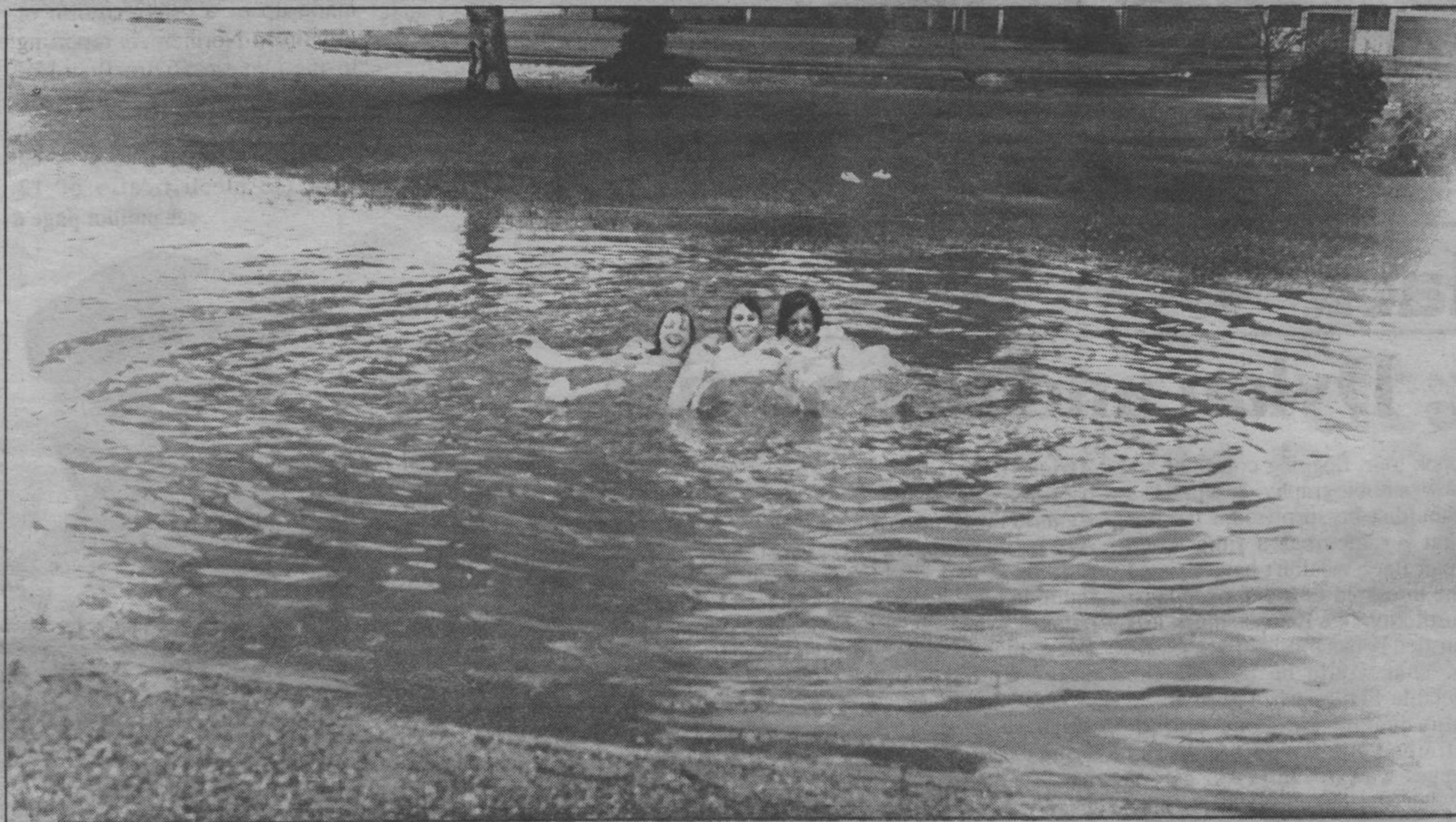
Time is right for swimming in the streets

Our area experienced quite a bit of rain on Sunday, July 12, proof of which can be seen above. The cats and dogs fell for about an hour causing flooding in some places in Terrace Bay. These three young ladies decided to go for a dip in front of the Norwood