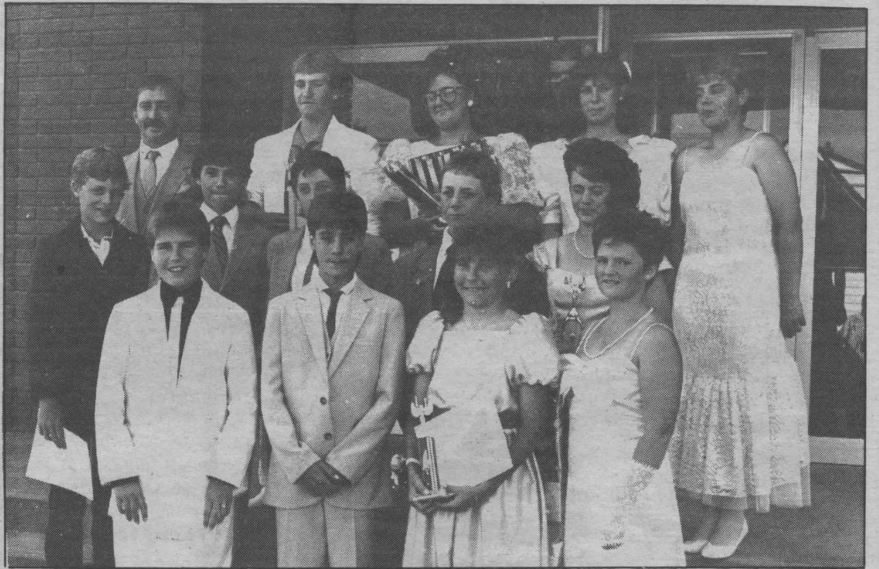
St. Martin Gr. 8 Graduating Class