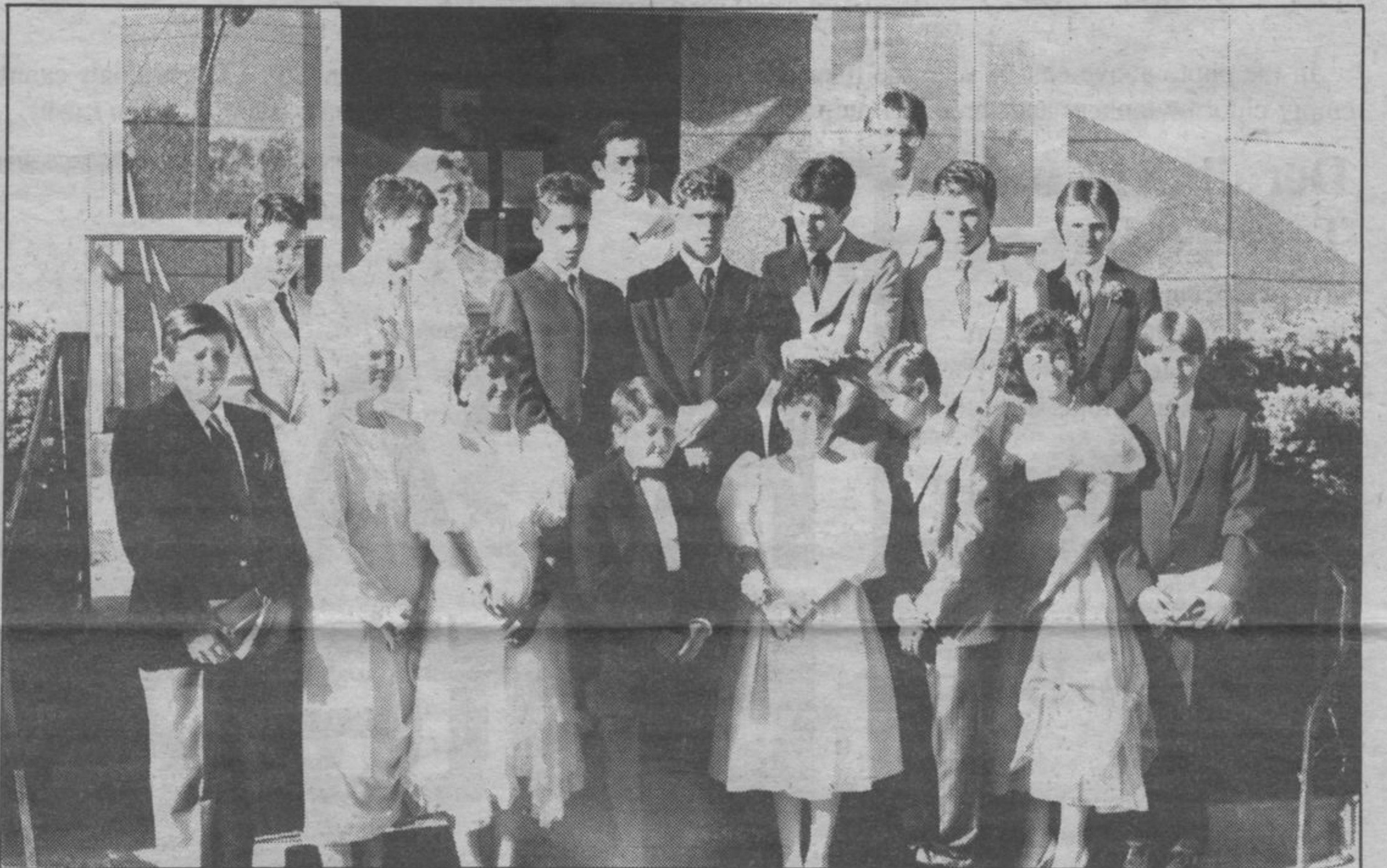
Holy Angels School

Students from Holy Angels who graduated from Gr. 8 this year are shown above at Holy Angels Roman Catholic Church in Schreiber after the graduation ceremony.