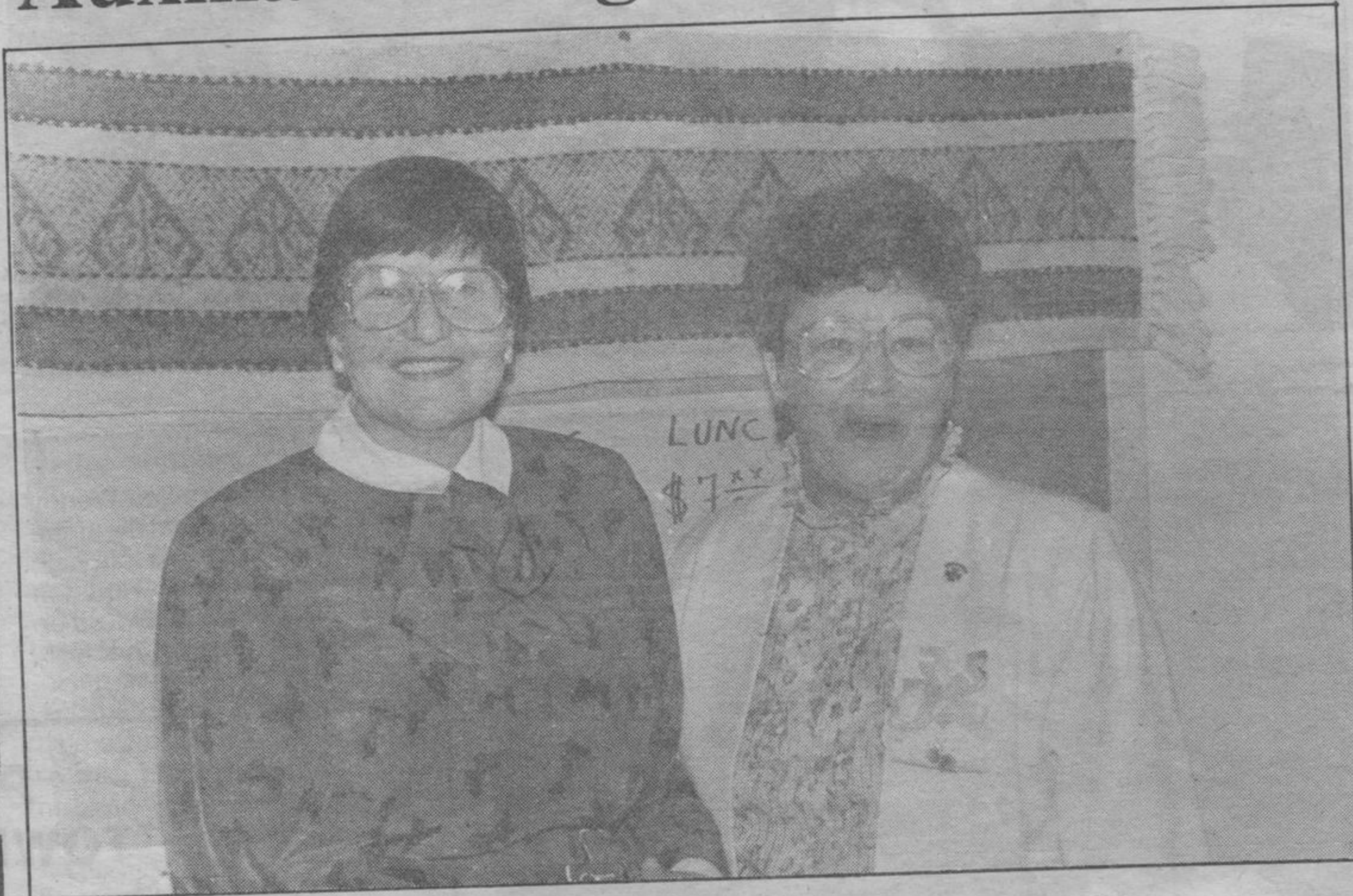
Chairmen of region