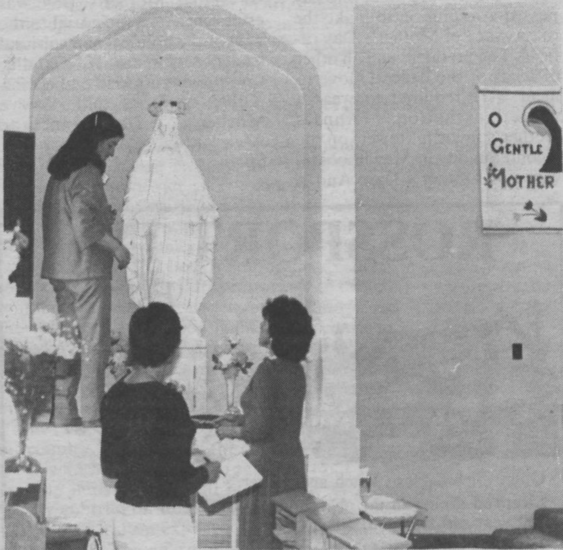
The crowning of Mother Mary

Next year the convention will be held at St. Dominic's in Thunder Bay.