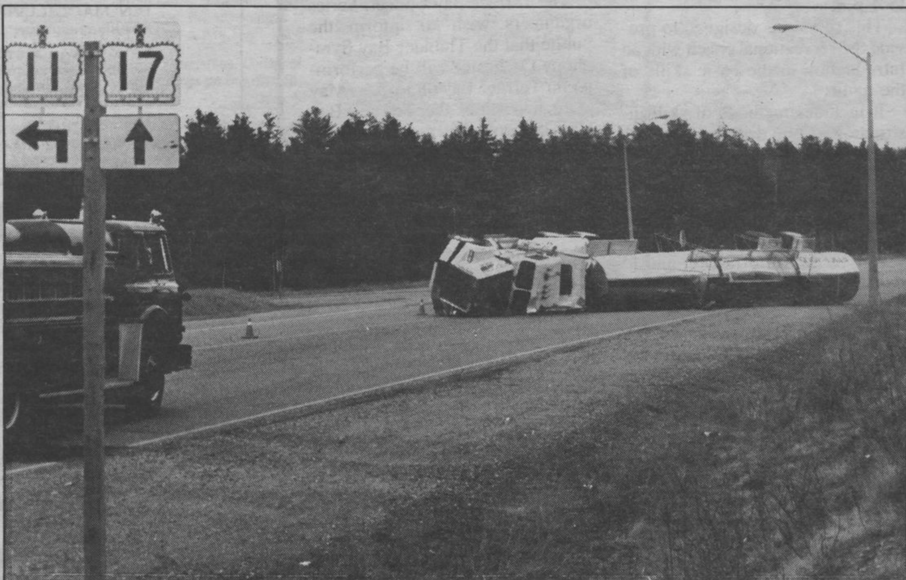
This tanker mishap caused almost 24 hours of highway disruption last Monday and Tuesday.

"We need some help from the premier," he said.