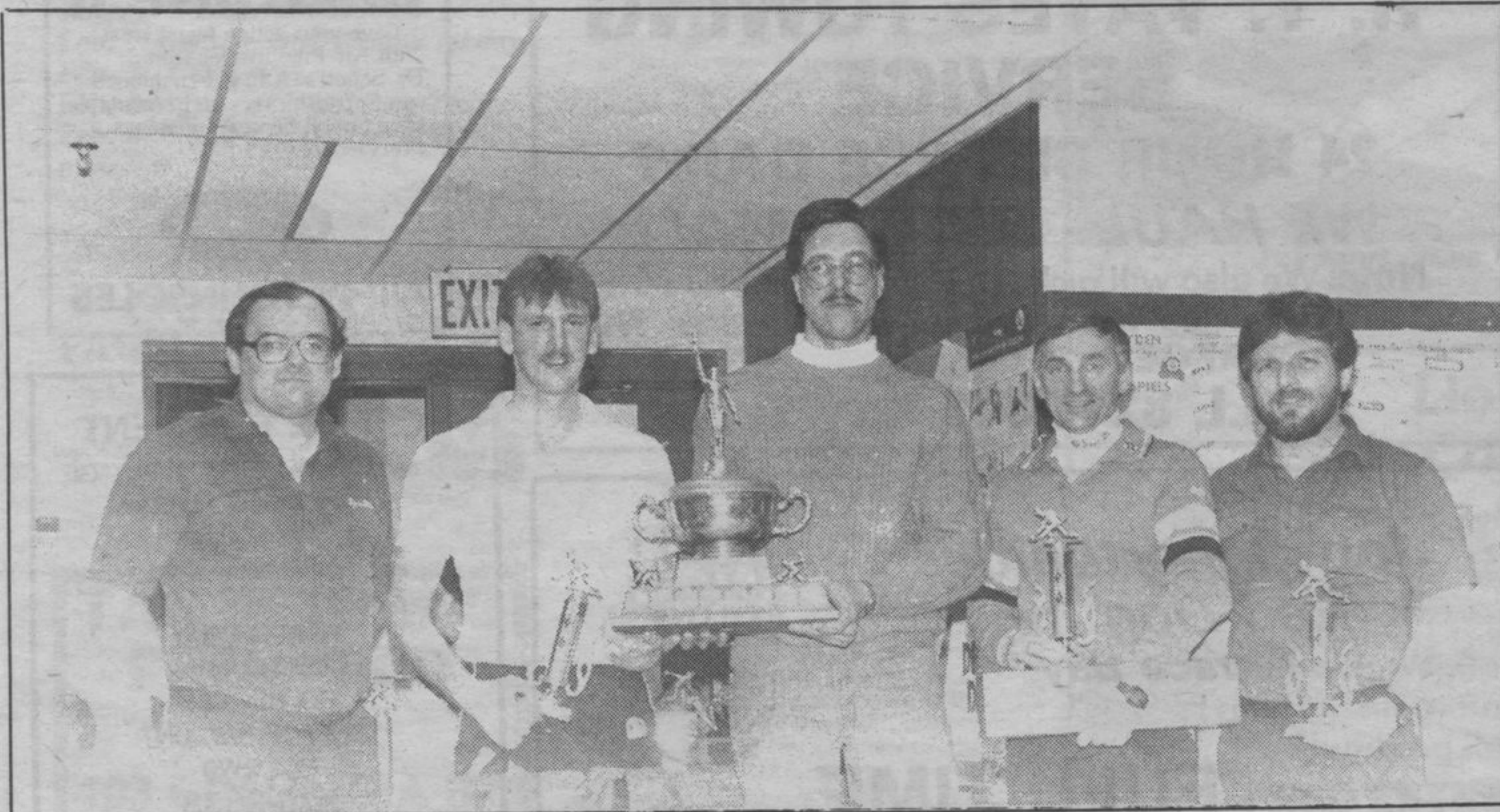
First place 'C' event