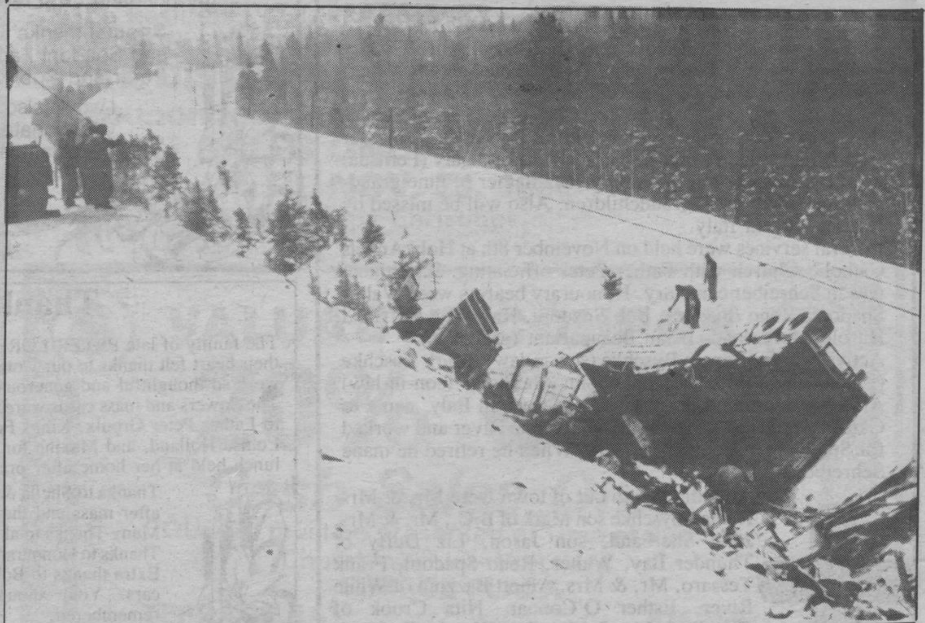
This transport carrying cattle was travelling east-bound on Highway 17 when it left the road near the Steele River bridge last week claiming the

Come out, join in the celebration and support your favorite artist or arts organization.