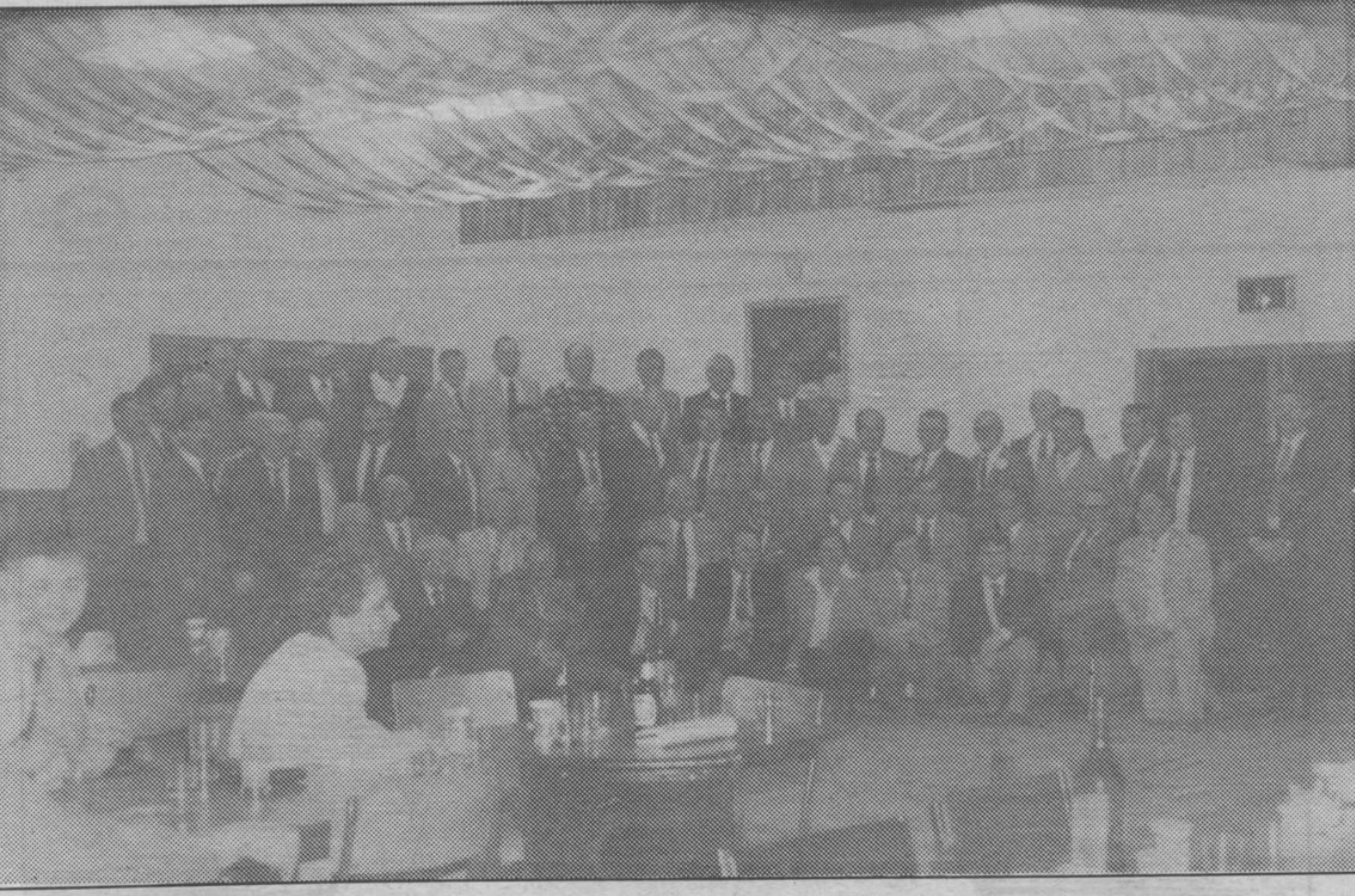
Shown above posing for the camera are the early retirees of Kimberly-Clark who celebrated last Saturday with a dinner and dance. After dinner, a film was shown that commemorated 100 years of the United Paperworkers' International Union.