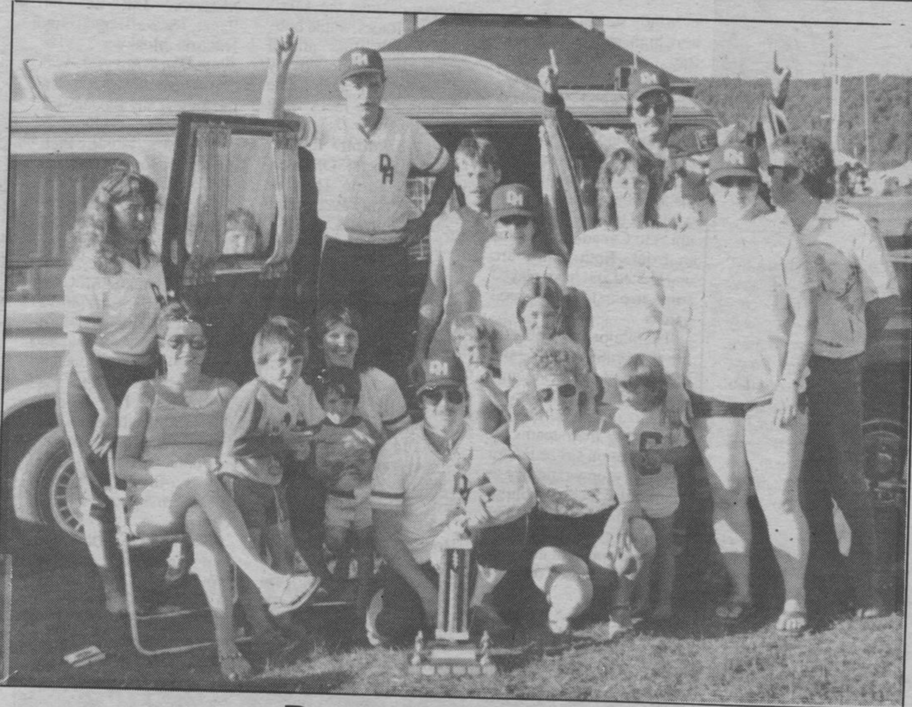
Deadheads are tops

The Deadheads team recently won the Schreiber Mixed Slo-Pitch League Championships, and posed for a group photo with their league trophy, seen in the foreground. This photo was taken on August 17.