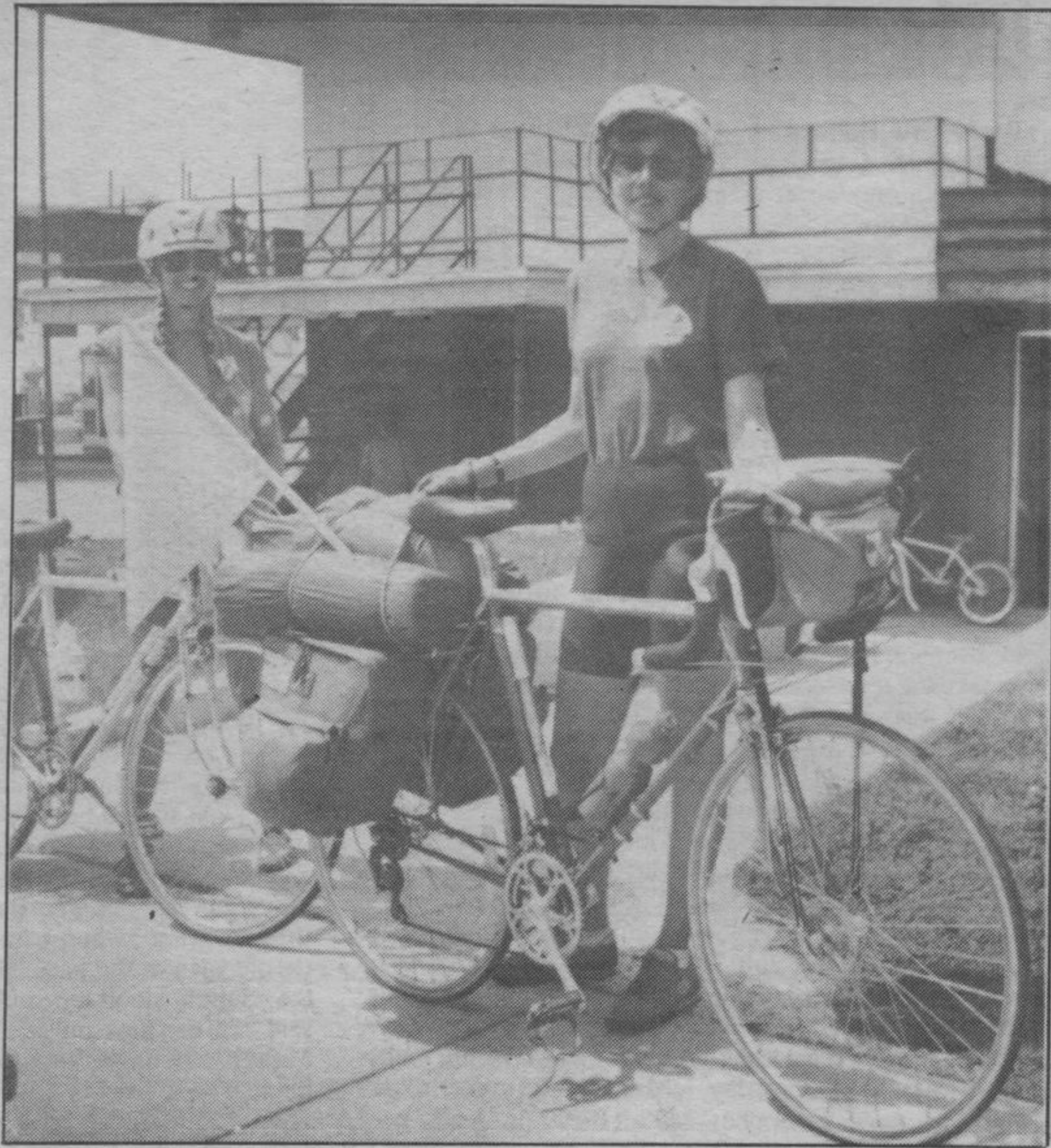
South meets north