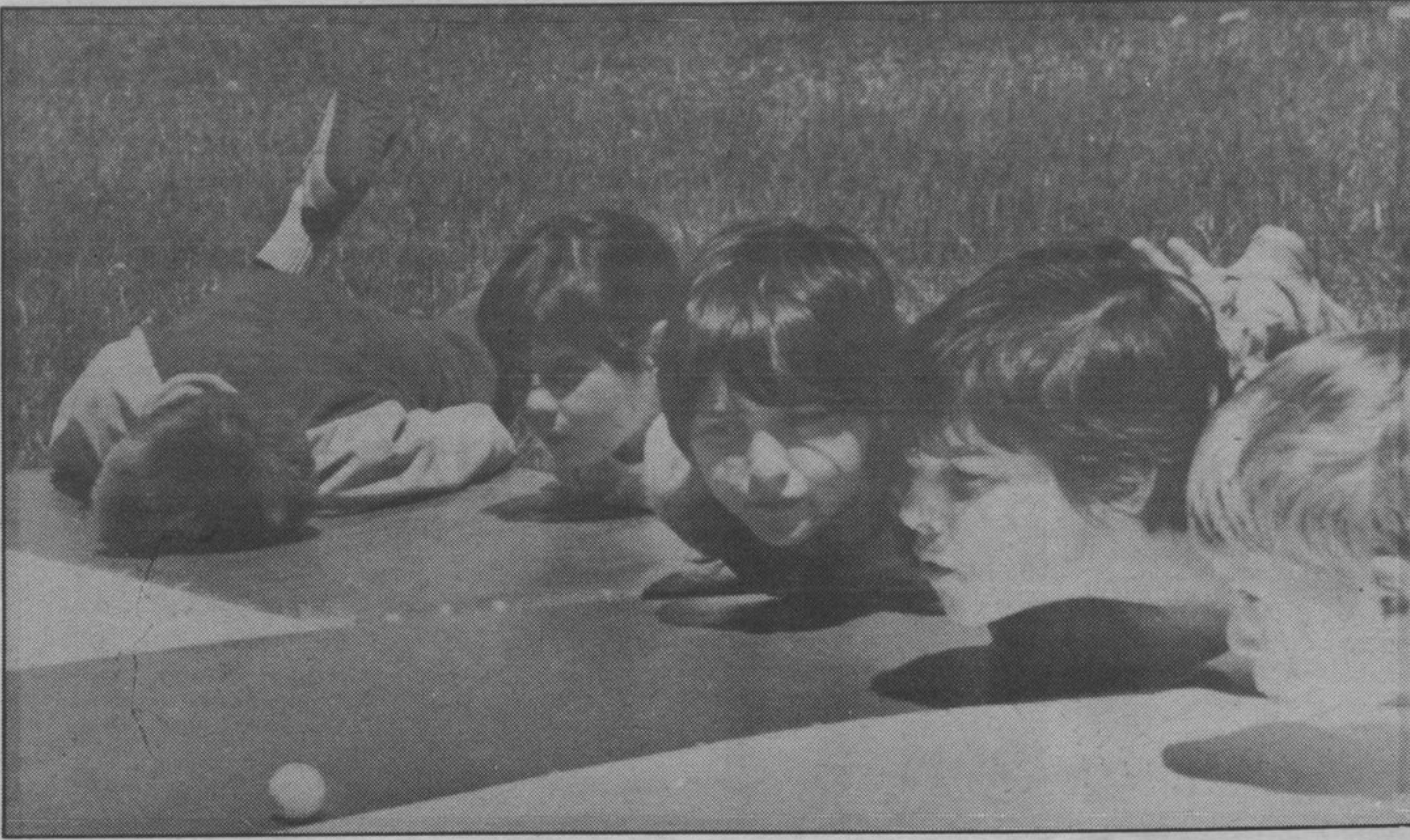
One too pooped

Although one of their teammates, at left, ran out of air and energy, these other youngsters combined their remaining lungpower to keep the game ball away from their side of the mat. It was just one of the contests