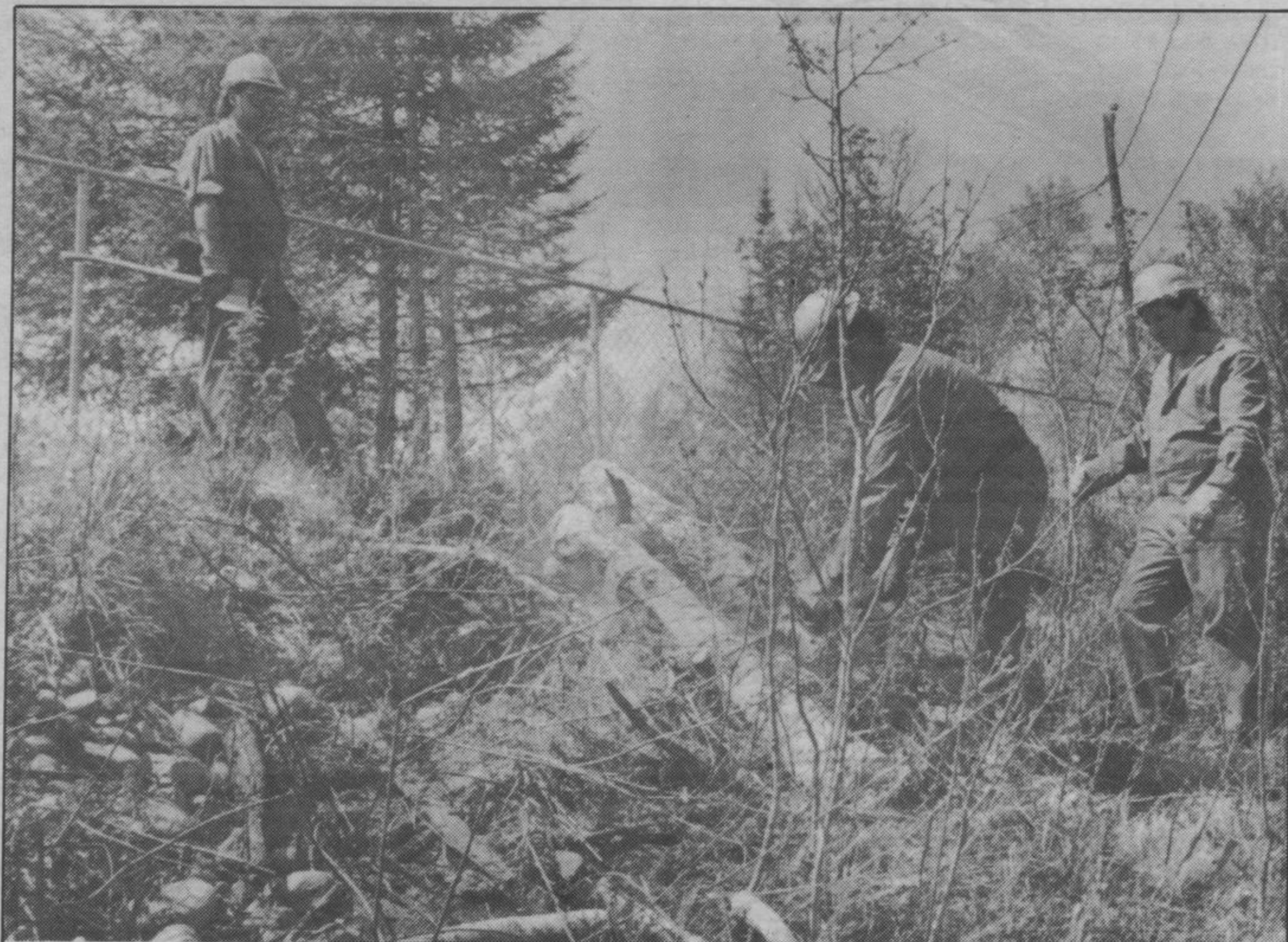
Clean up continues

The May 21 forest fire near Terrace Bay may already be just a bad memory for most, but work at the burn site continued earlier this month. Ministry of Natural Resources crews were on hand to cut up and dispose