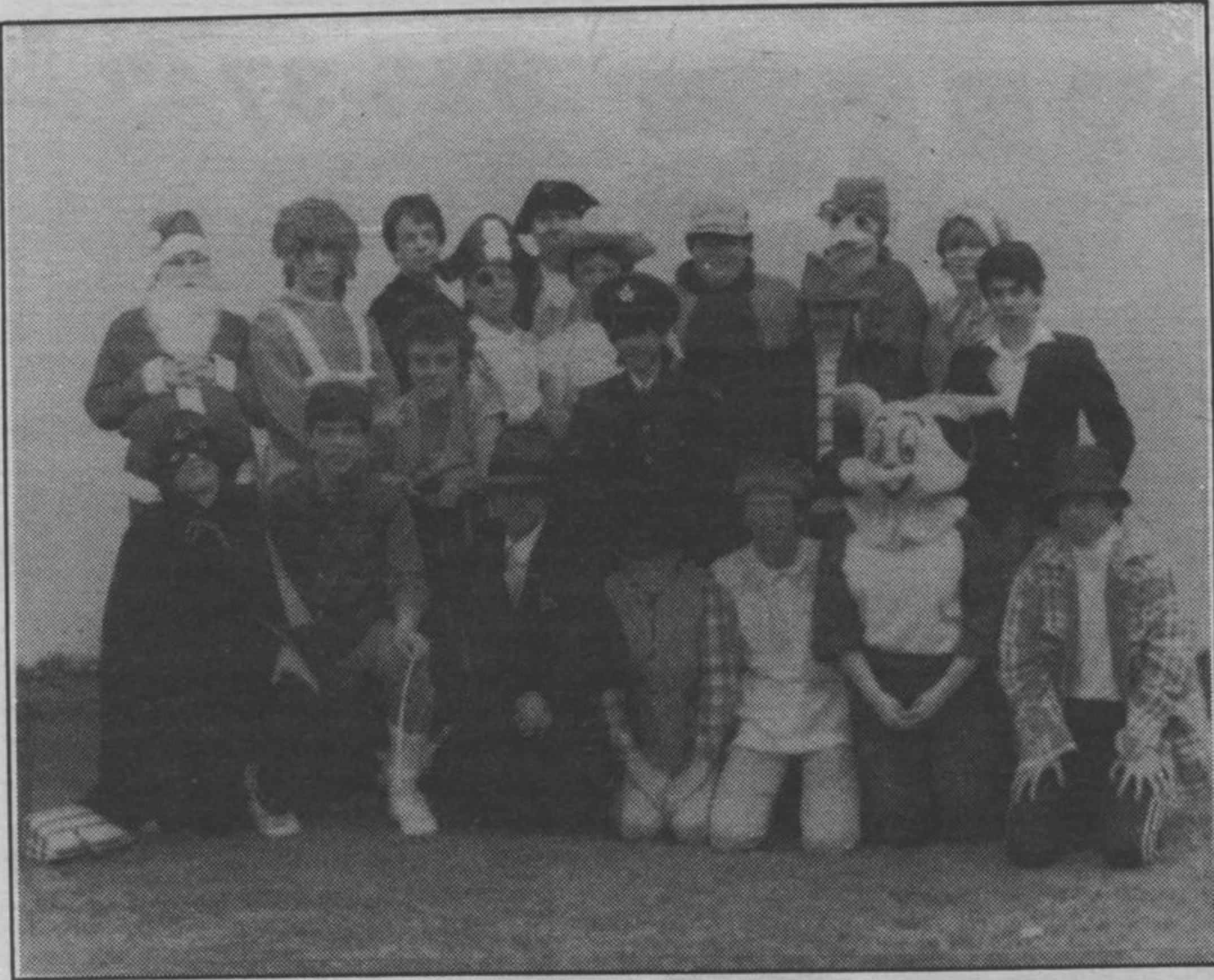
Santa in spring?

Santa Claus was just one of the many characters the Grade Eight students at Holy Angels School in Schreiber transformed into during Education Week April 24 to 30. The class, taking part in Dress-As-Day, donned all sorts of costumes in the spirit of becoming a cartoon, fictional, or historical character for the day.