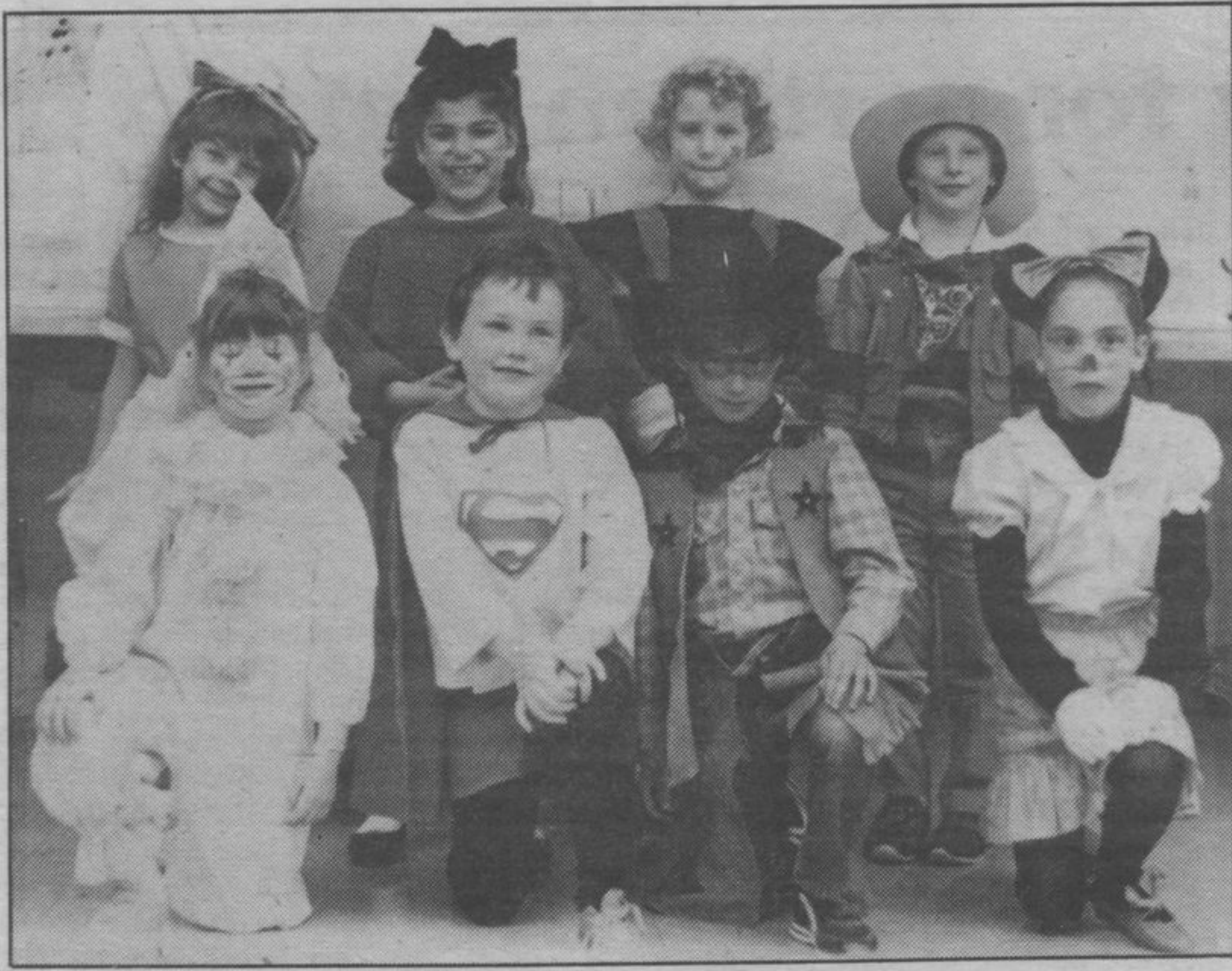
Superboy ... and others

The Grade One students at Holy Angels School in Schreiber presented a wide variety of fictional and historical characters during Dress-As-Day at the school. The event was held as part of Education Week, held April 24 to 30. Here we see Superboy, as well as a sheriff, a clown, a cowboy, a mouse, and others.