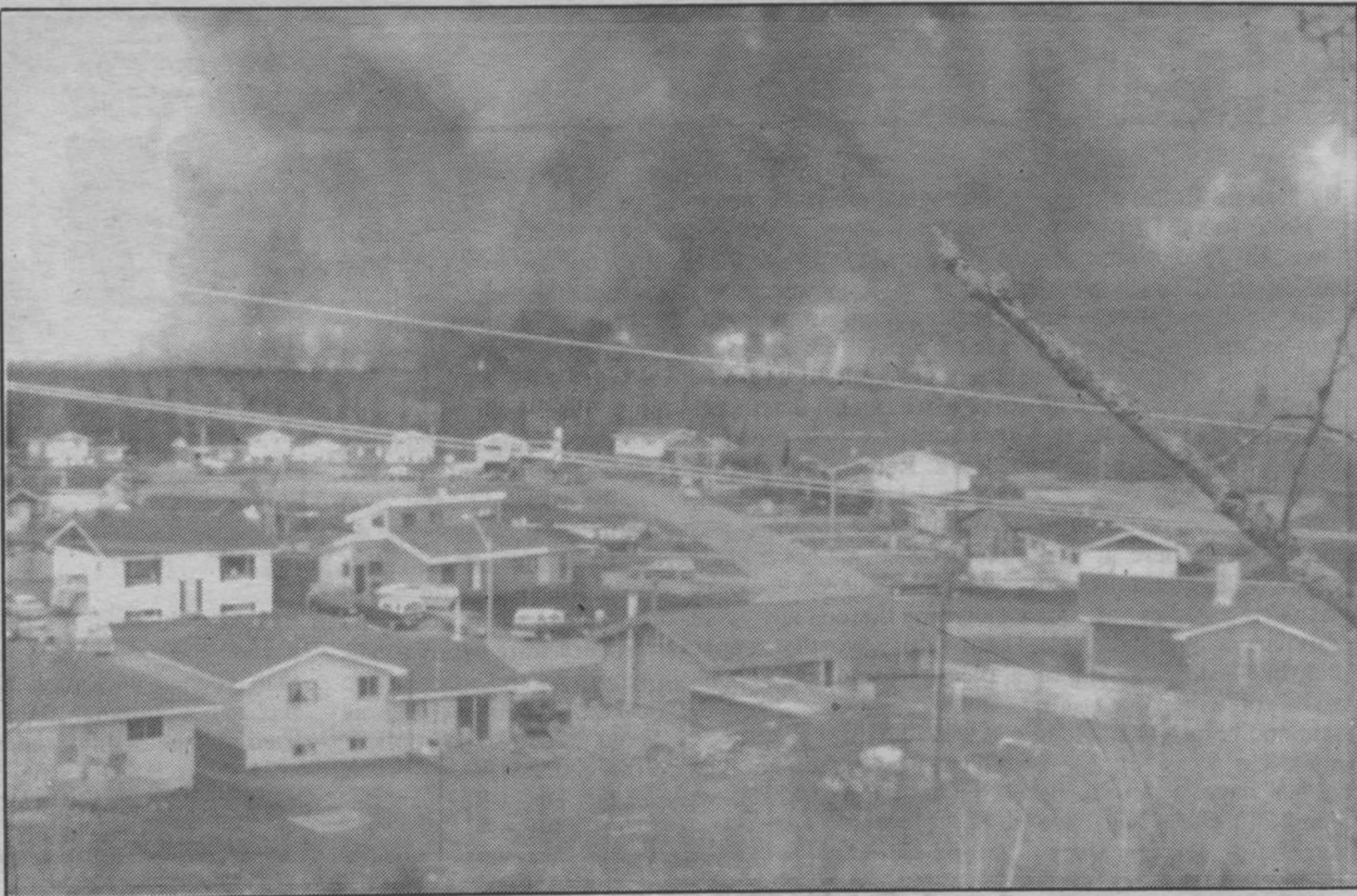
Flames creep close to houses