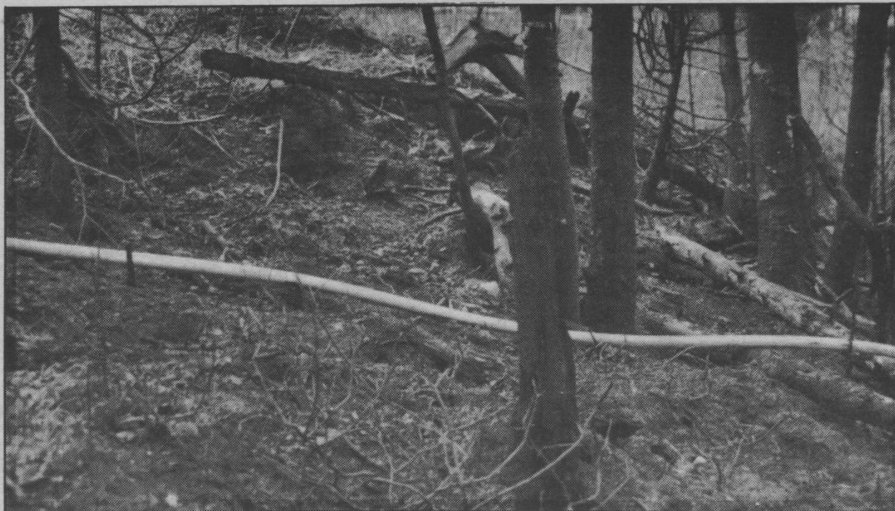
Hose in the ashes

The forest fire which ravaged an area 250 hectares in size to the east of Terrace Bay on May 21 spared few jackpine trees, and this one was no exception, as its bark and branches were completely scorched.