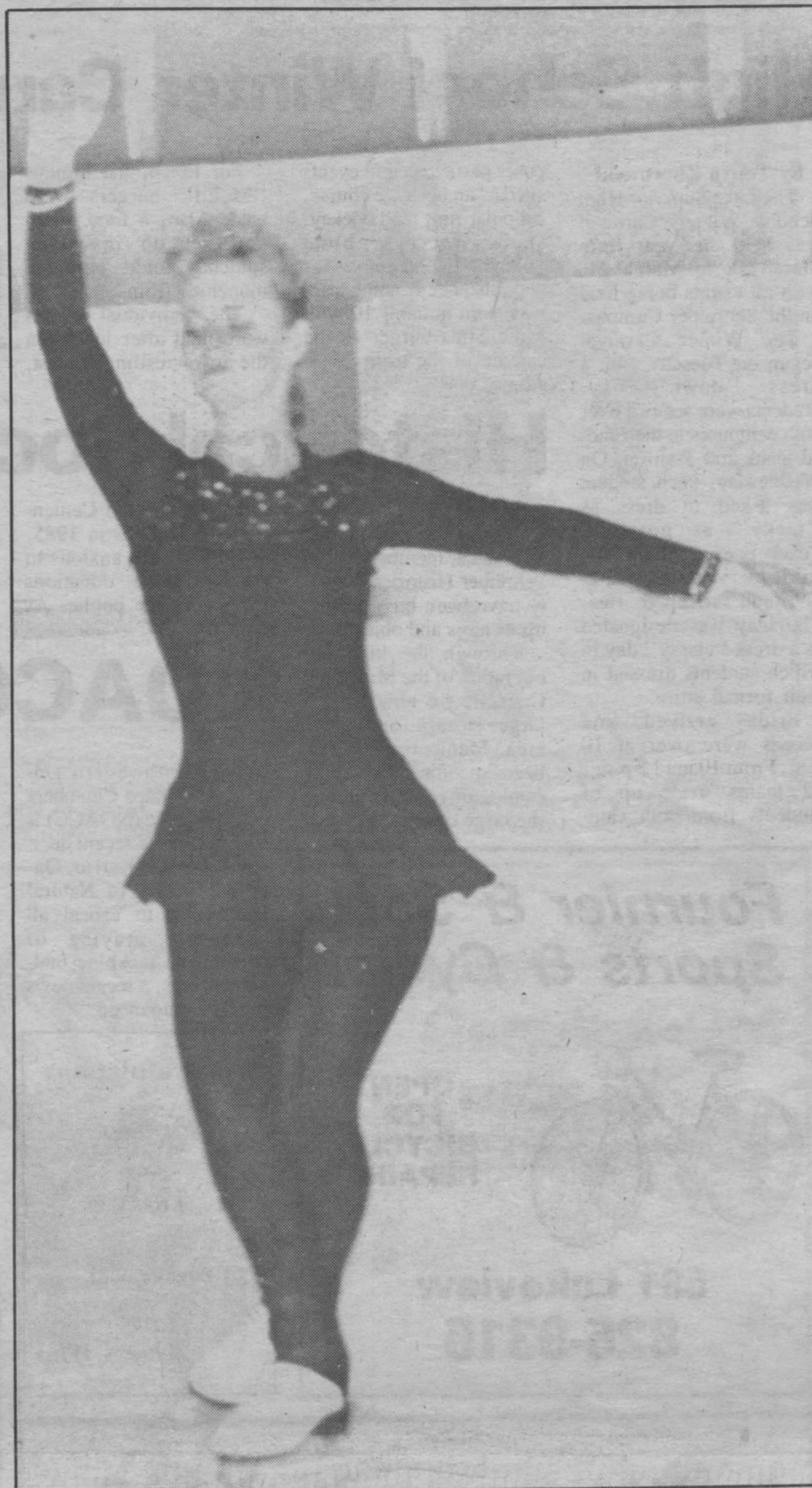
Concentration on ice