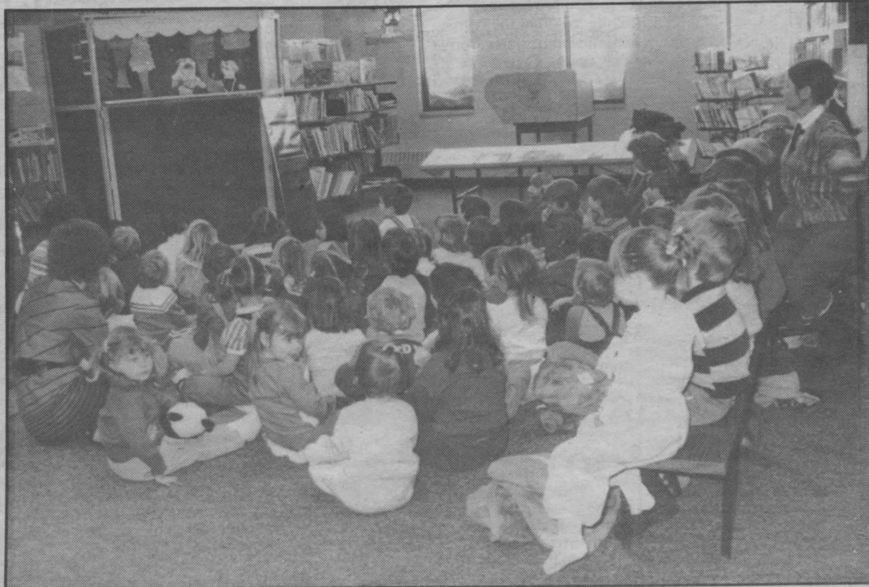
A puppet show was held as part of Story Time for preschoolers aged three to six at the Terrace Bay Public Library on February 11. The youngsters were ob-

Council then decided the best course of action would be to reassure department heads and other town employees that their input has been appreciated in the past and that it will be asked for in the future.