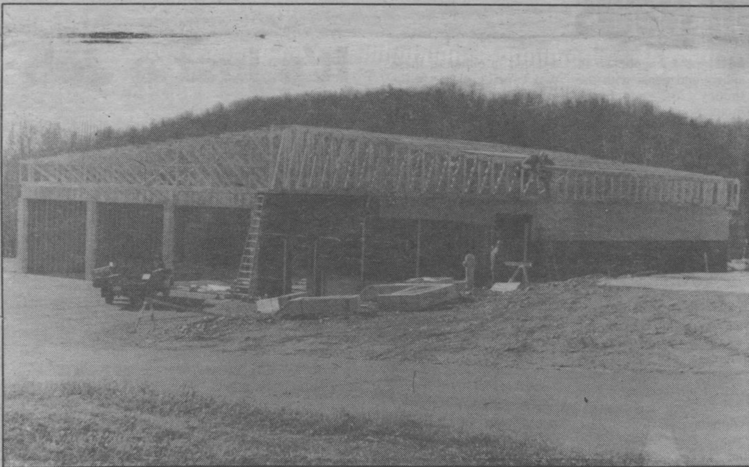
The new Fire Hall is well under way. Schreiber is hoping for the completion next summer.