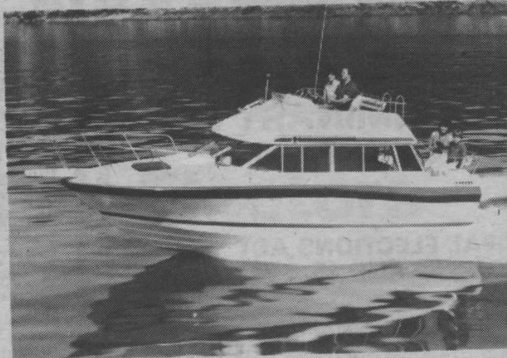
2450 CIERA COMMAND BRIDGE