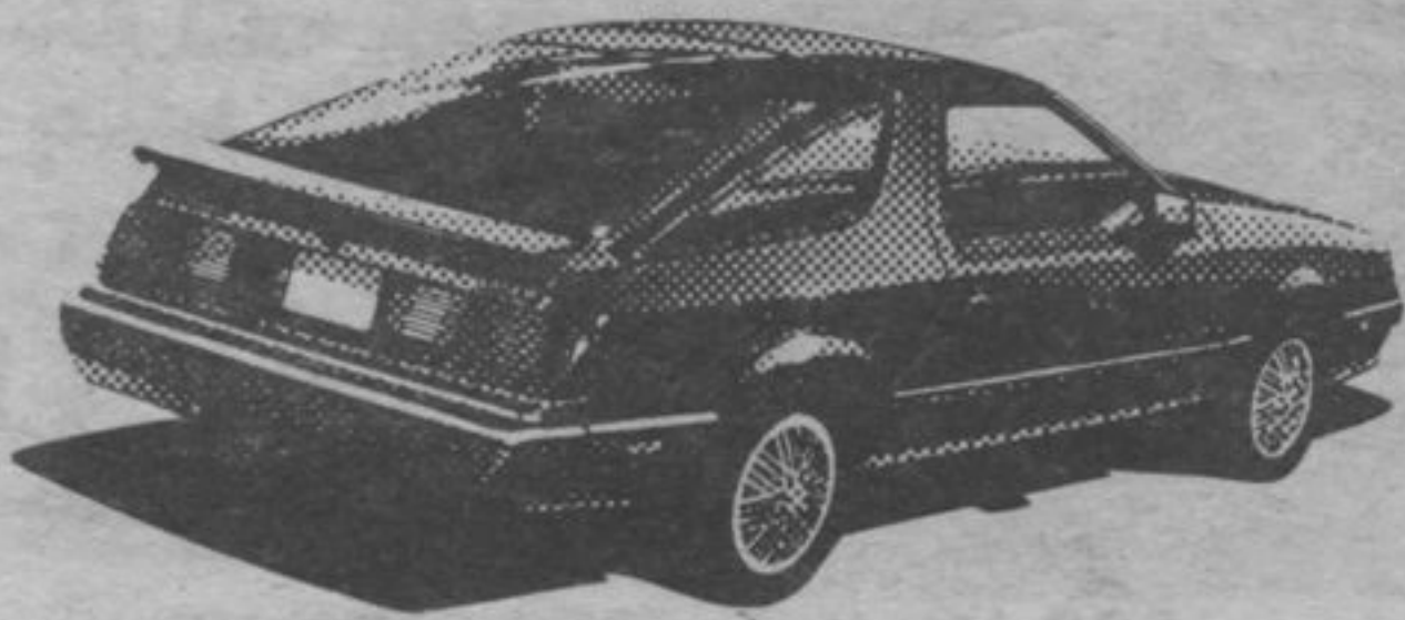
Laser XE plus T-Bar Roof