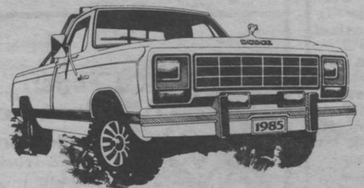
Power Ram D100's and D150's

This offer will not last long. Be sure to get in on the savings won. The place to buy your new car or truck is T.B.C. and the time is now.