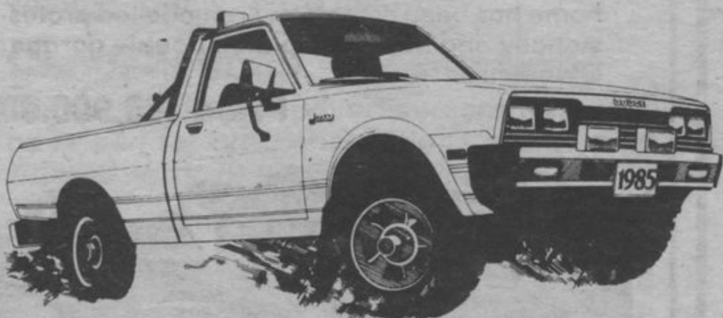
Power Ram 50

This offer will not last long. Be sure to get in on the savings won. The place to buy your new car or truck is T.B.C. and the time is now.