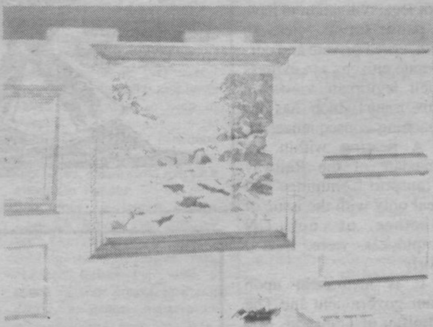
Paintings by Local Artists.