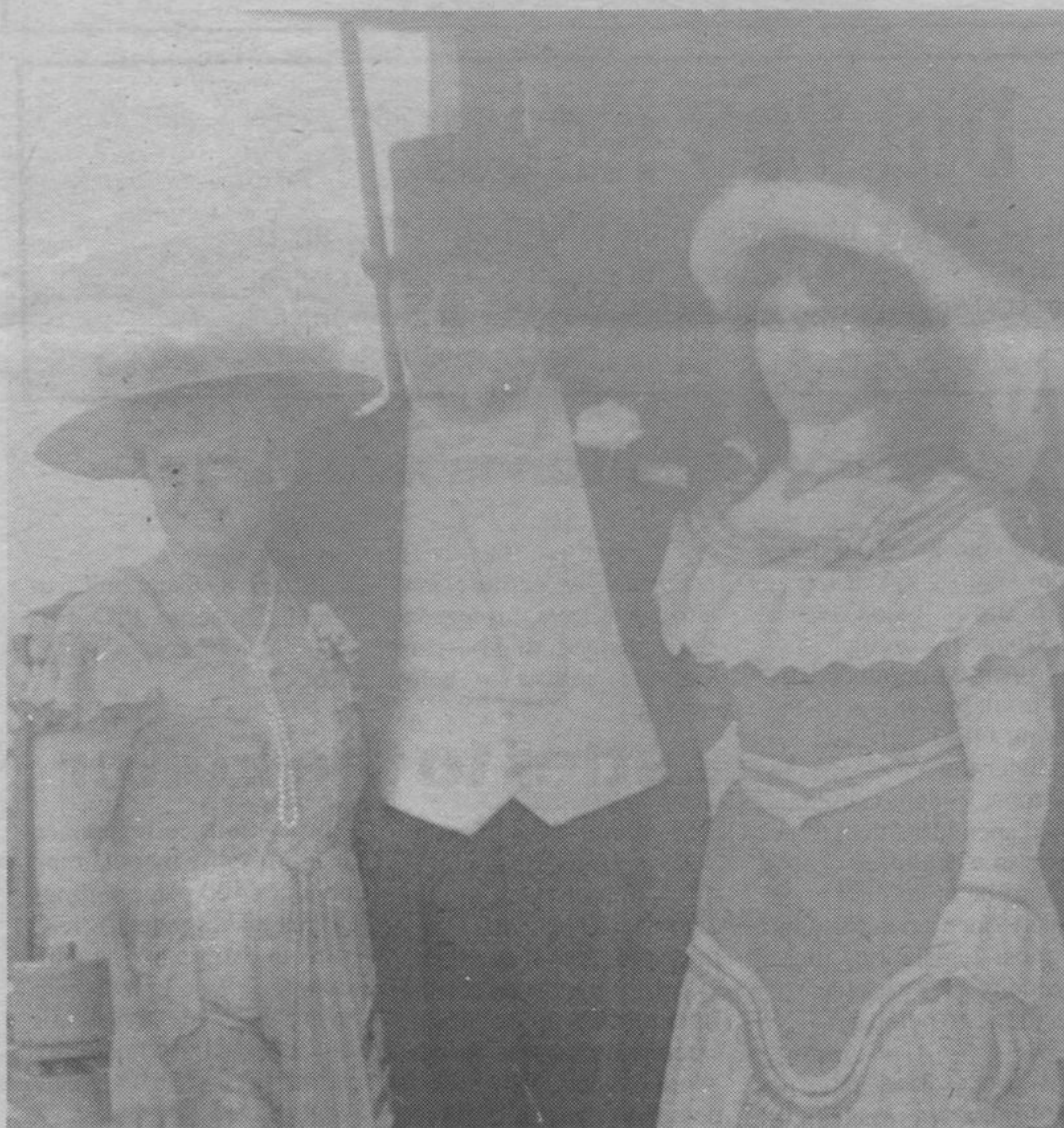
Guest appearance by Sir William Cornelius Van Horne to C.P. Centennial Train.