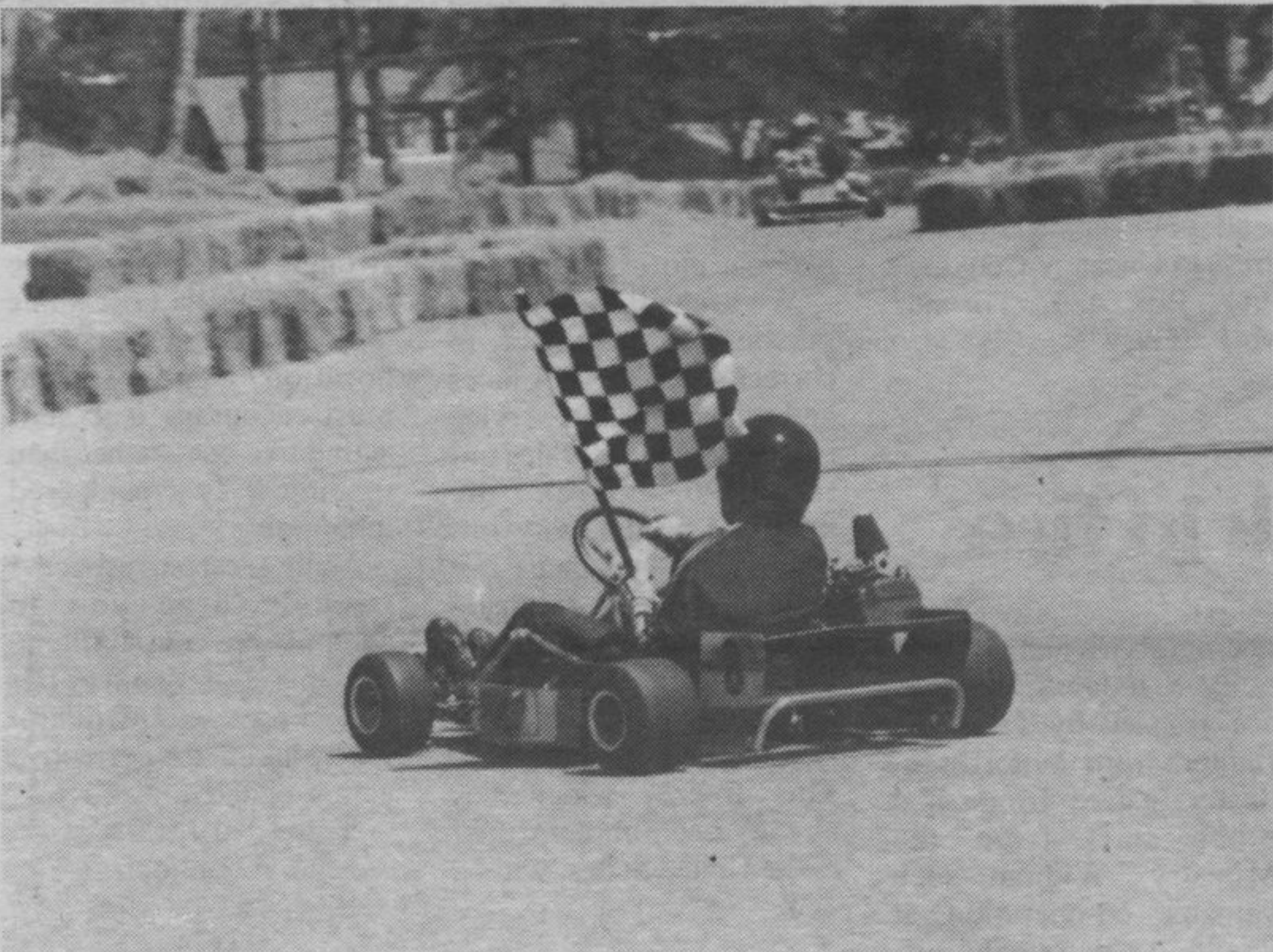
The winner gets the flag