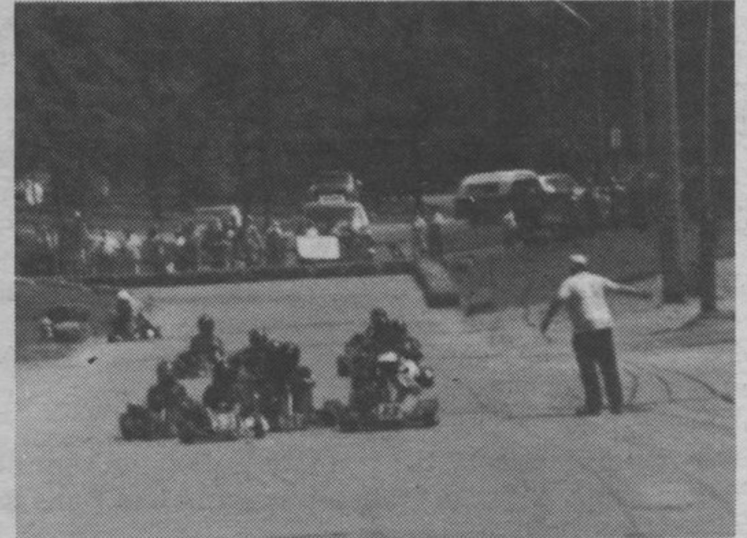
And they're off