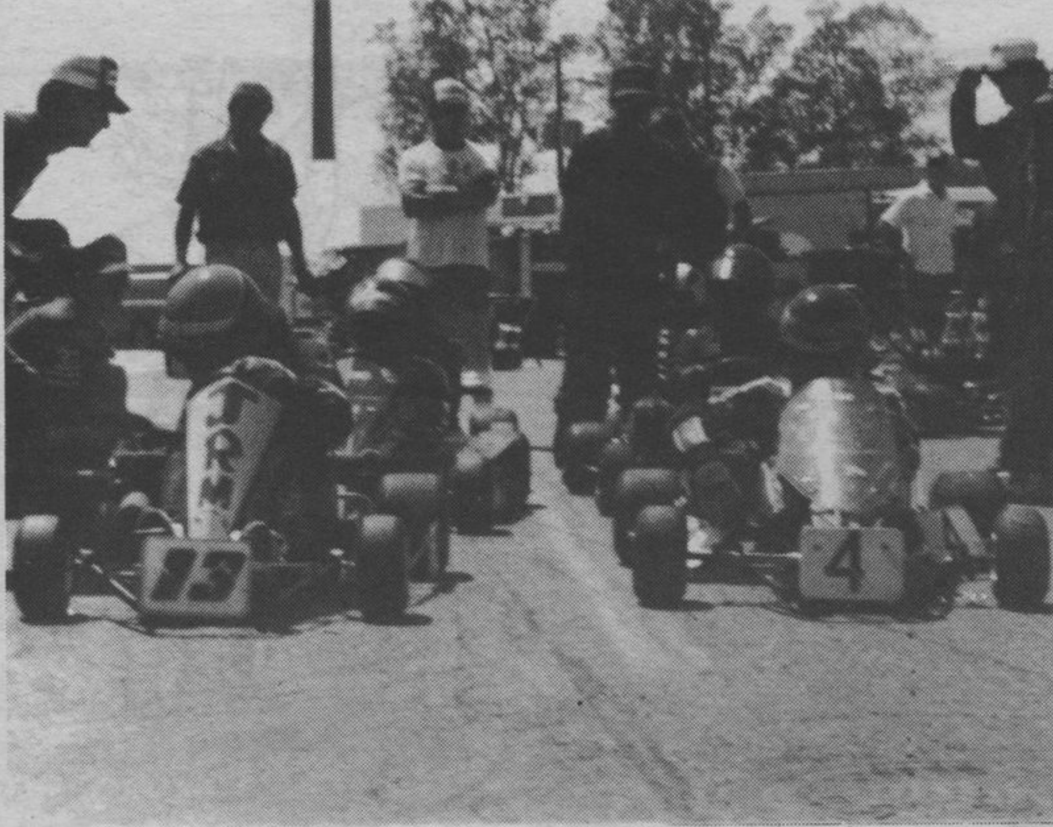
Start your engines