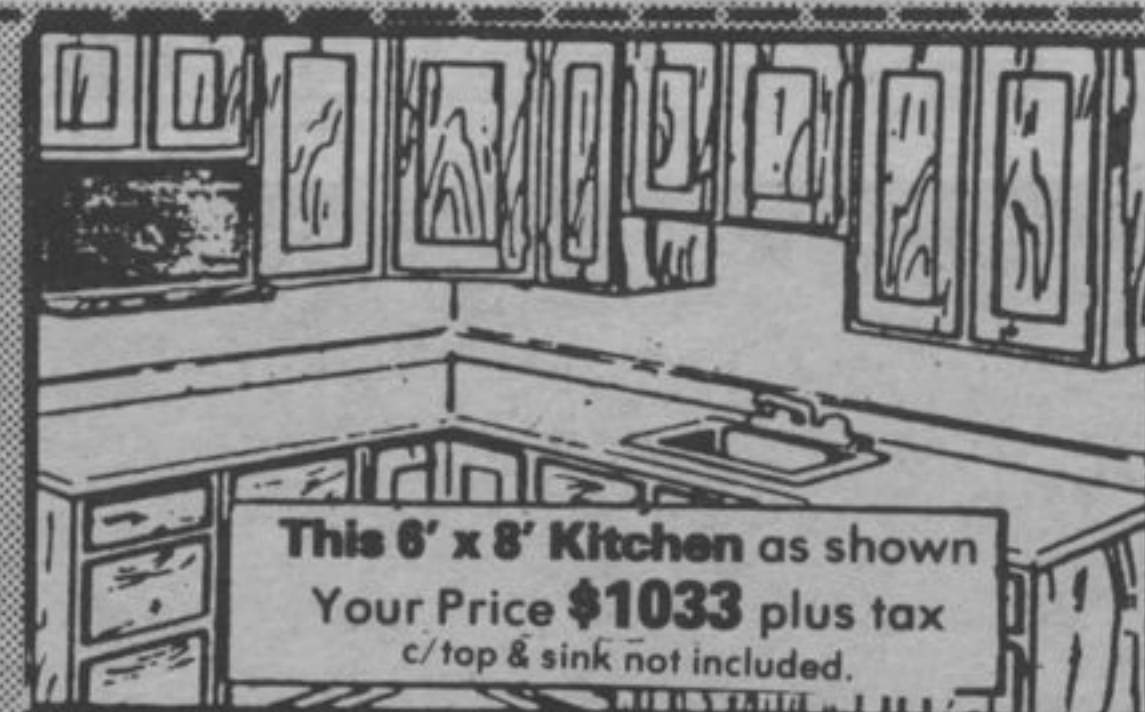
This 6' x 8' Kitchen as shown Your Price $1033 plus tax c/top & sink not included.

All ECONO PRINCETON cabinets are made with high quality construction methods for long lasting durability. Drawers on all base units have the plastic drawer guide and oak drawer runner system. All cabinets have an almond colored, vinyl covered interior - never needs painting. The ECONO PRINCETON doors are made with solid oak stiles and plywood center panels. Available in light Oak finish only.