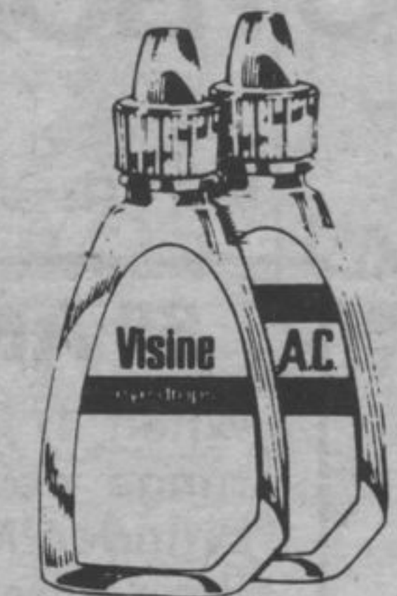
Visine gets the red out. Visine A.C. for allergies and colds.