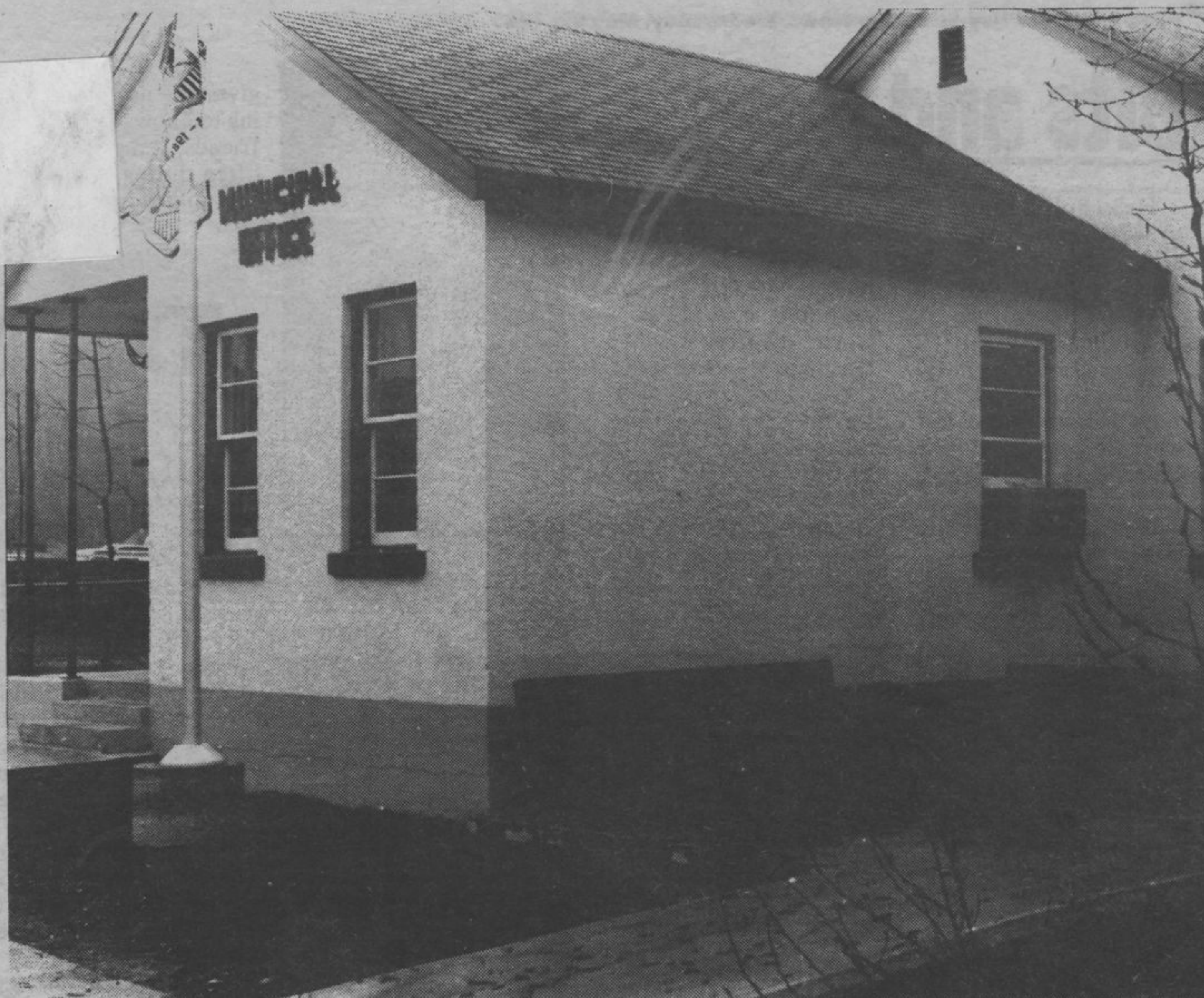
New benches at a number of locations in Schreiber to commemorate 100 years.

Serving Terrace Bay, Schreiber and Rosport 35¢