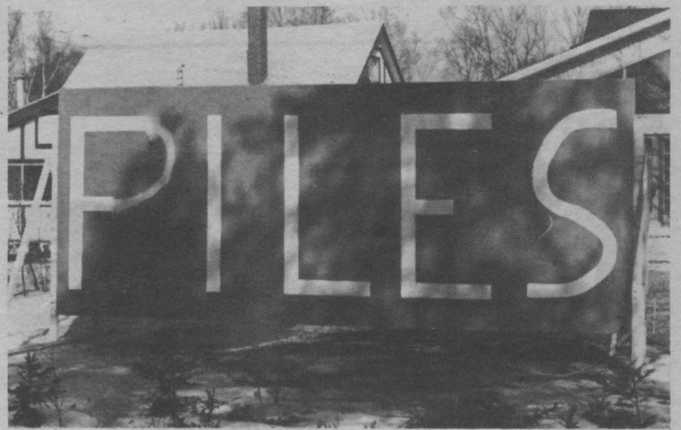
-Vandalism continues to plague PC Candidate Jim Files' promotional signs.