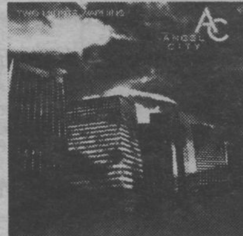
ANGEL CITY, 'Two Minute Warning' on MCA record label