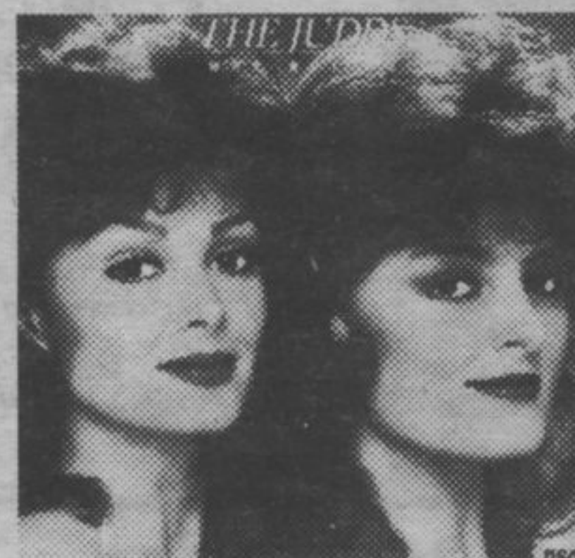
THE JUDDS, 'Why not me?' recorded on RCA label