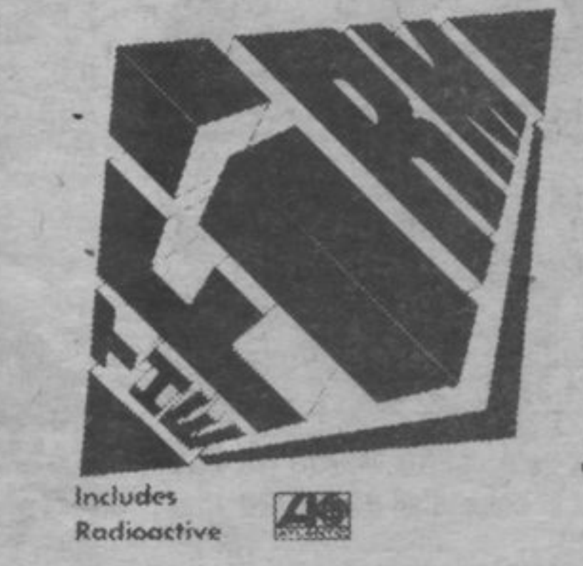
THE FIRM includes 'Radioactive'. Recorded on WEA label