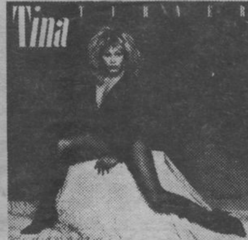
TINA TURNER, 'Private Dancer' on Capitol recording label