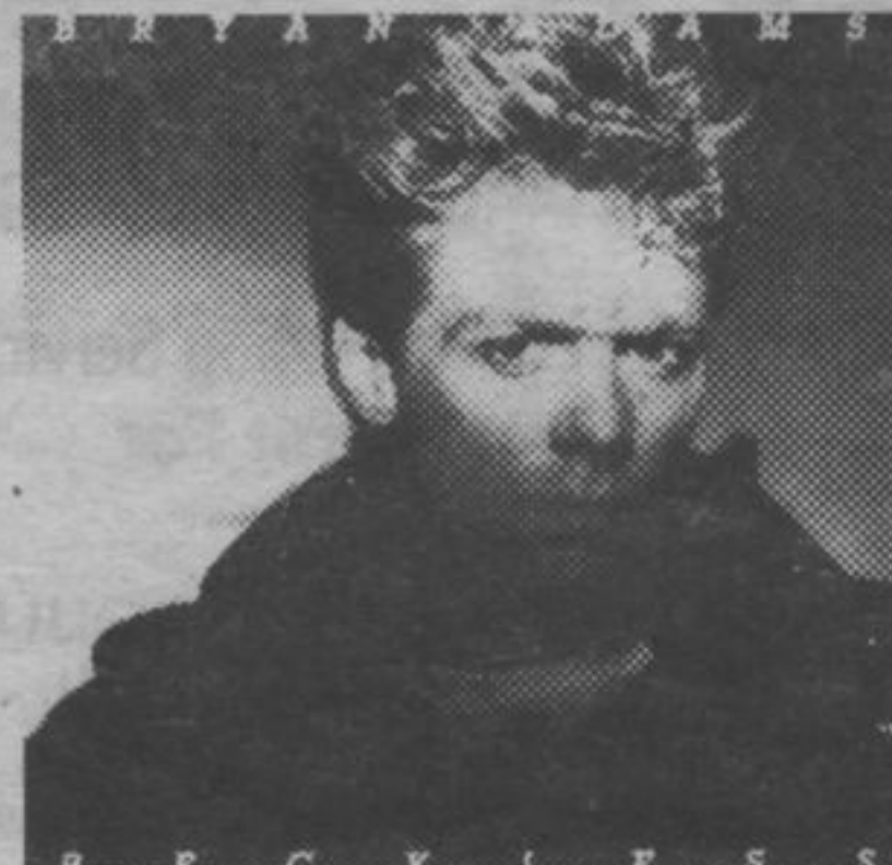
BRYAN ADAMS, 'Reckless' on A&M recording label