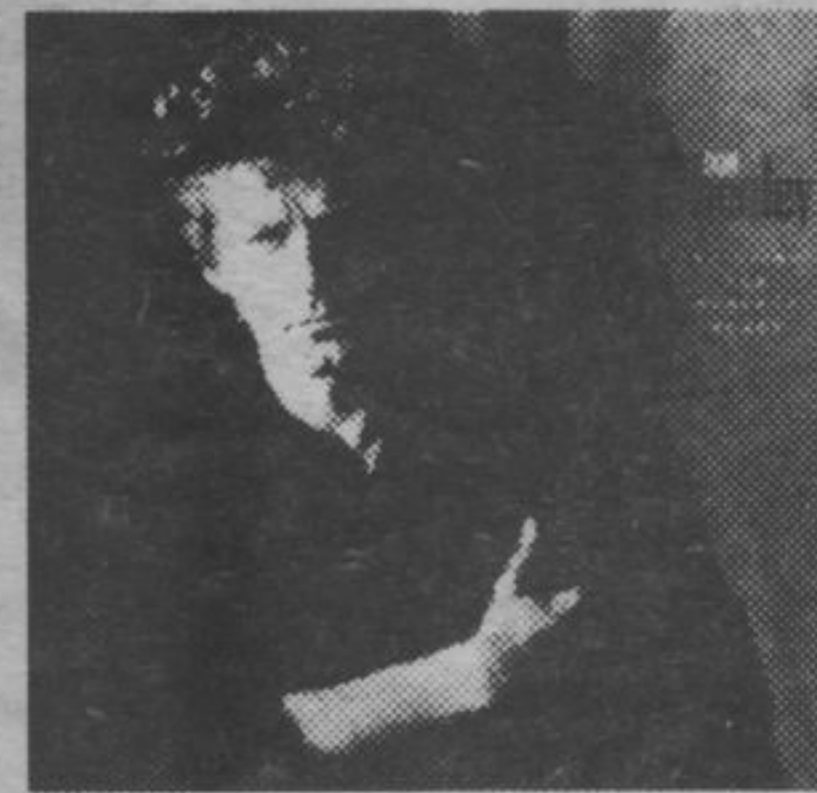
DON HENLEY, 'Building the Perfect Beast', WEA label