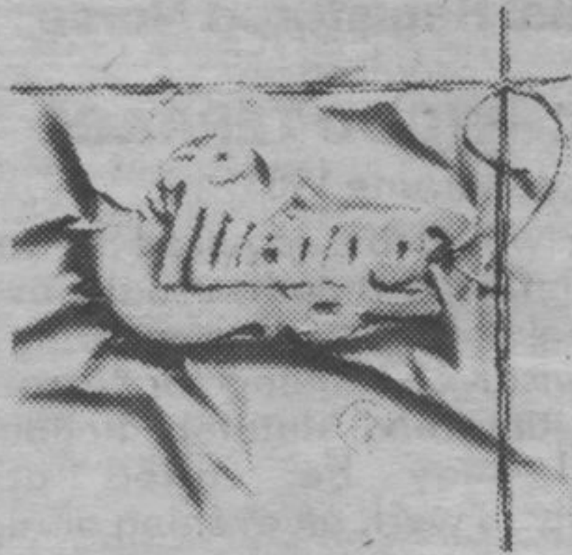
CHICAGO, 'Chicago 17' on WEA recording label