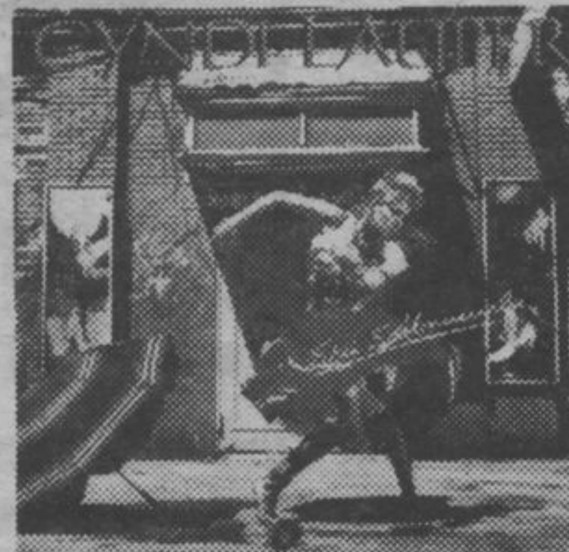
CYNDI LAUPER, 'She's so Unusual' on CBS label