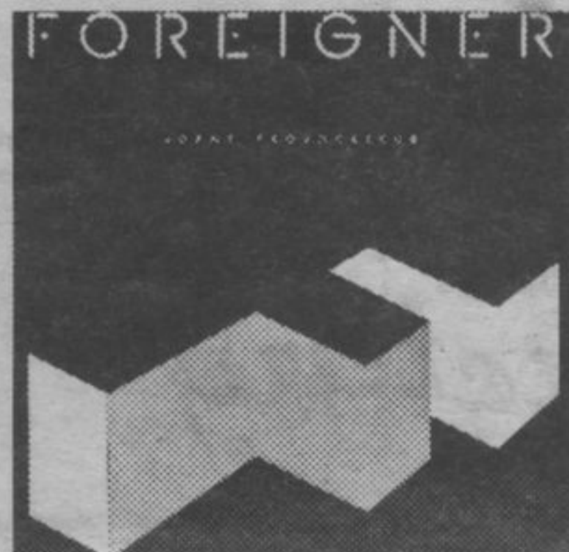
FOREIGNER, 'Agent Provocateur' on the WEA recording label