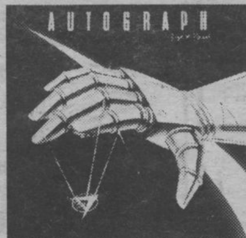
AUTOGRAPH, 'Sign in Please' on the RCA recording label