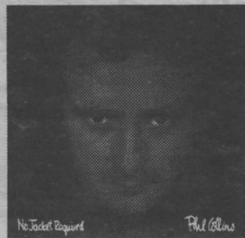
PHIL COLLINS, 'No Jacket Required', recorded on WEA