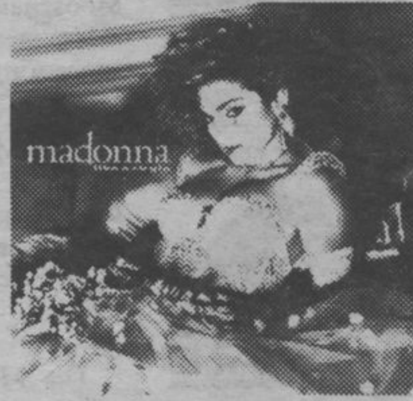
MADONNA, 'Like a Virgin' on WEA recording label.