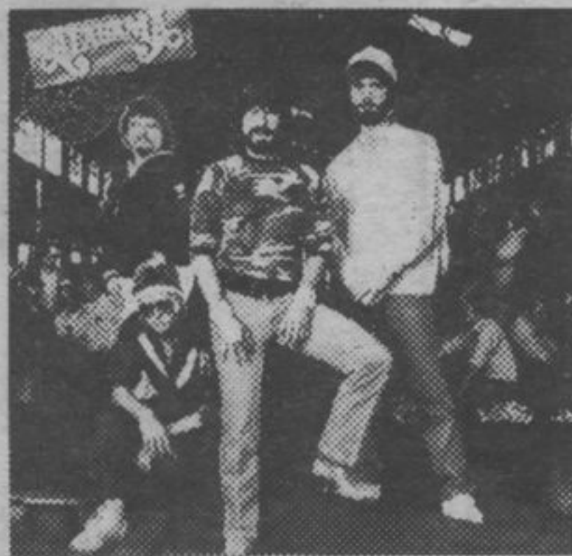
ALABAMA sings '40 hour week' on the RCA recording label