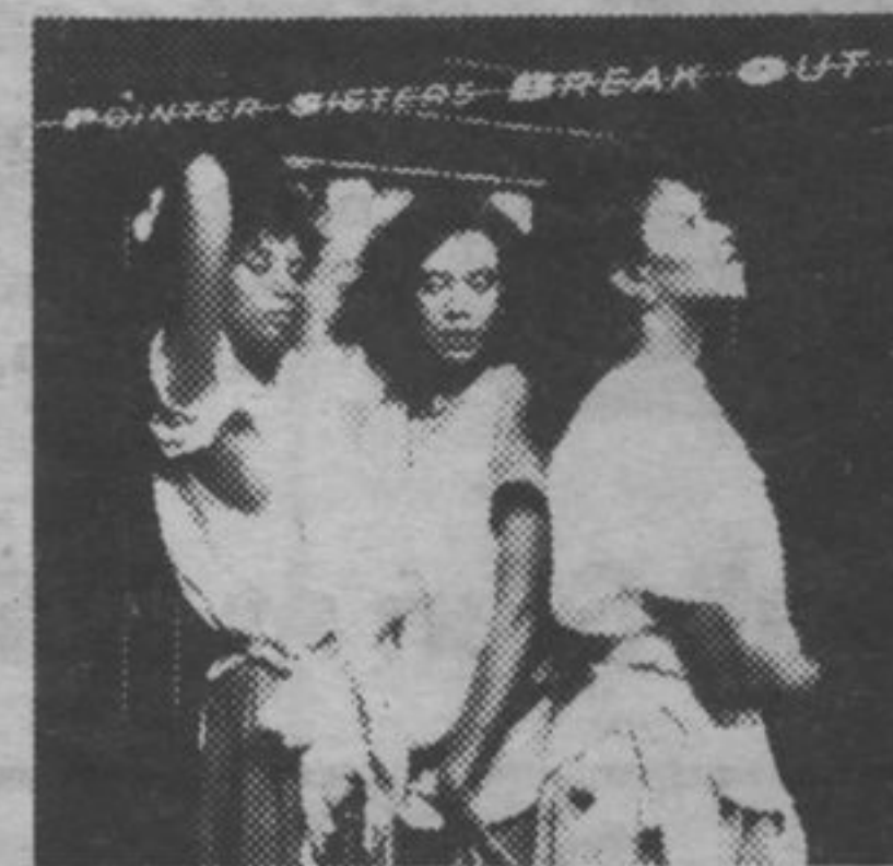
POINTER SISTERS, 'Break Out' on RCA recording label