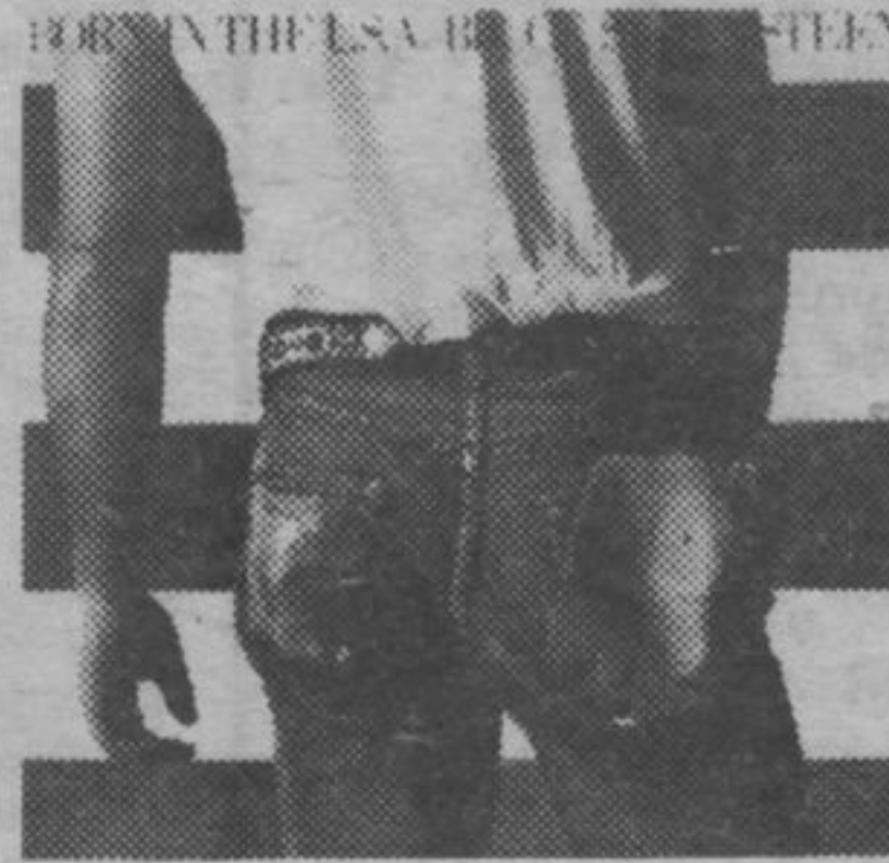
BRUCE SPRINGSTEEN sings 'Born in the U.S.A.', on CBS