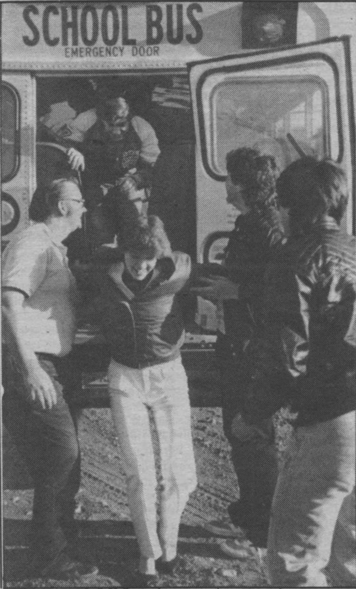
L.S.H.S. students practise evacuation.

Hockey jackets $16 up. Jerseys $10 up. Buy direct from the factory and save! Peter Upton Jacket Works. Toll free 1-800-661-6461 for your free catalogue. O-30