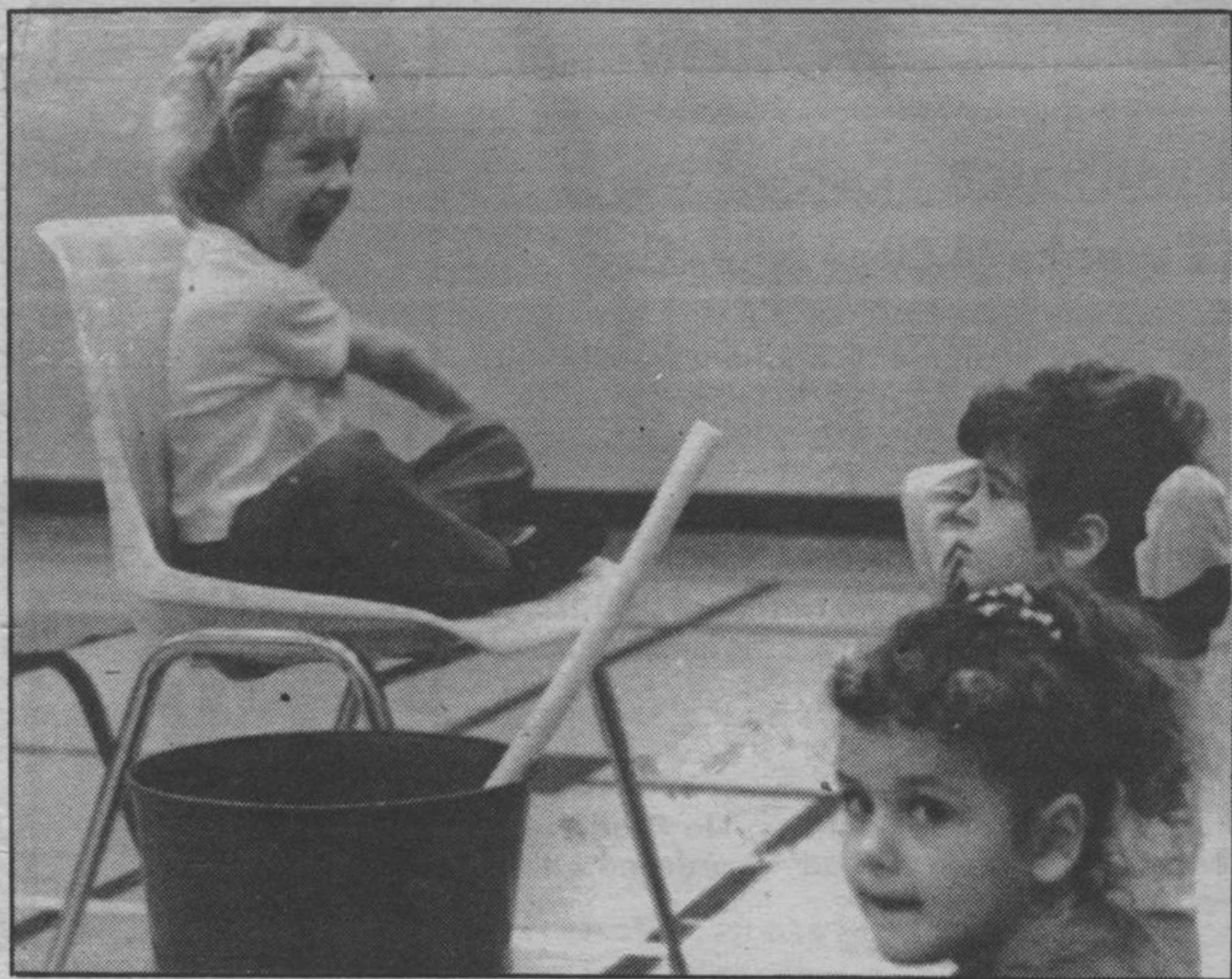
I'm driving the Schreiber Public School bus!