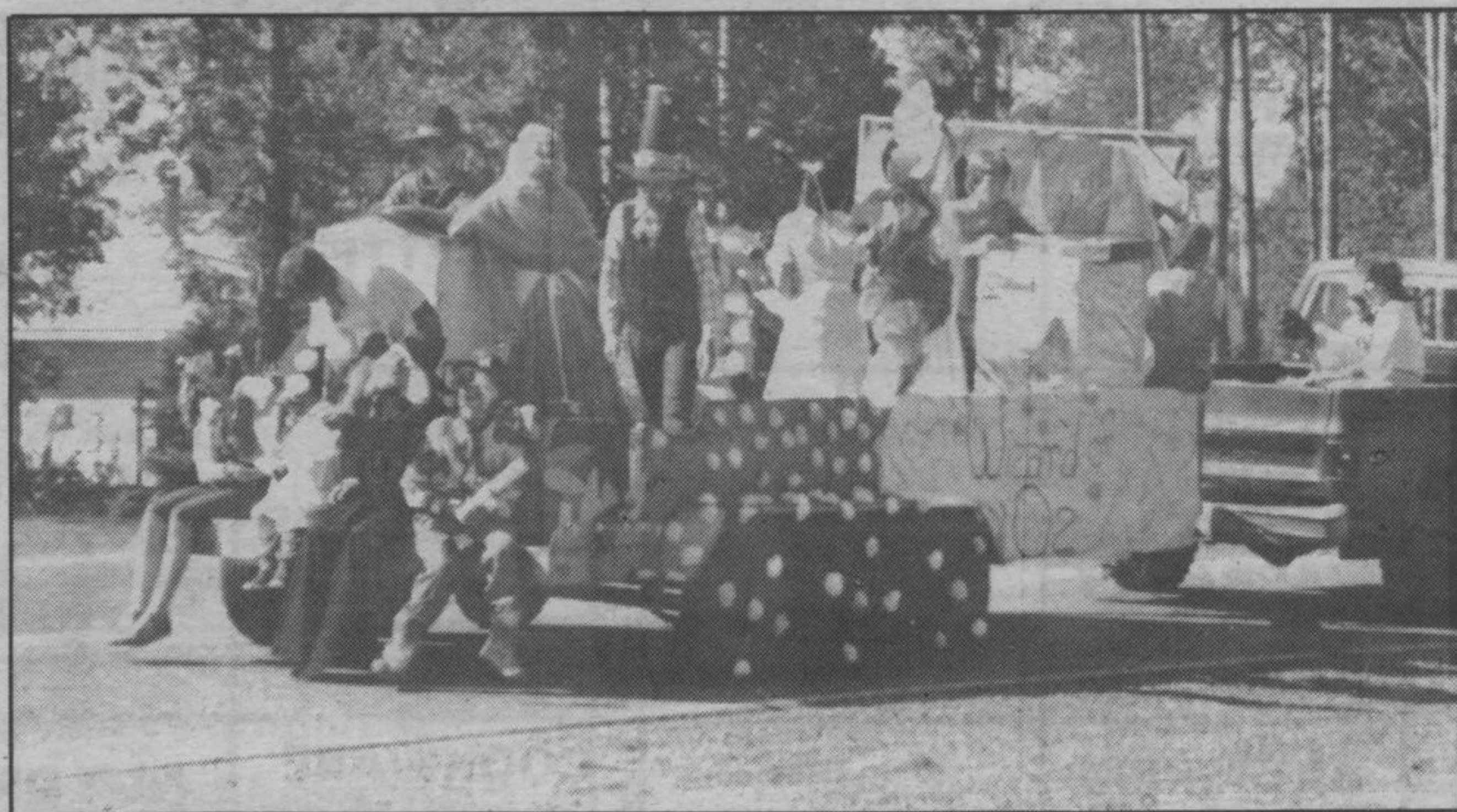
Graduating Grade eight students from Terrace Bay Public School put their production of the "Wizard of Oz" on this colourful float.