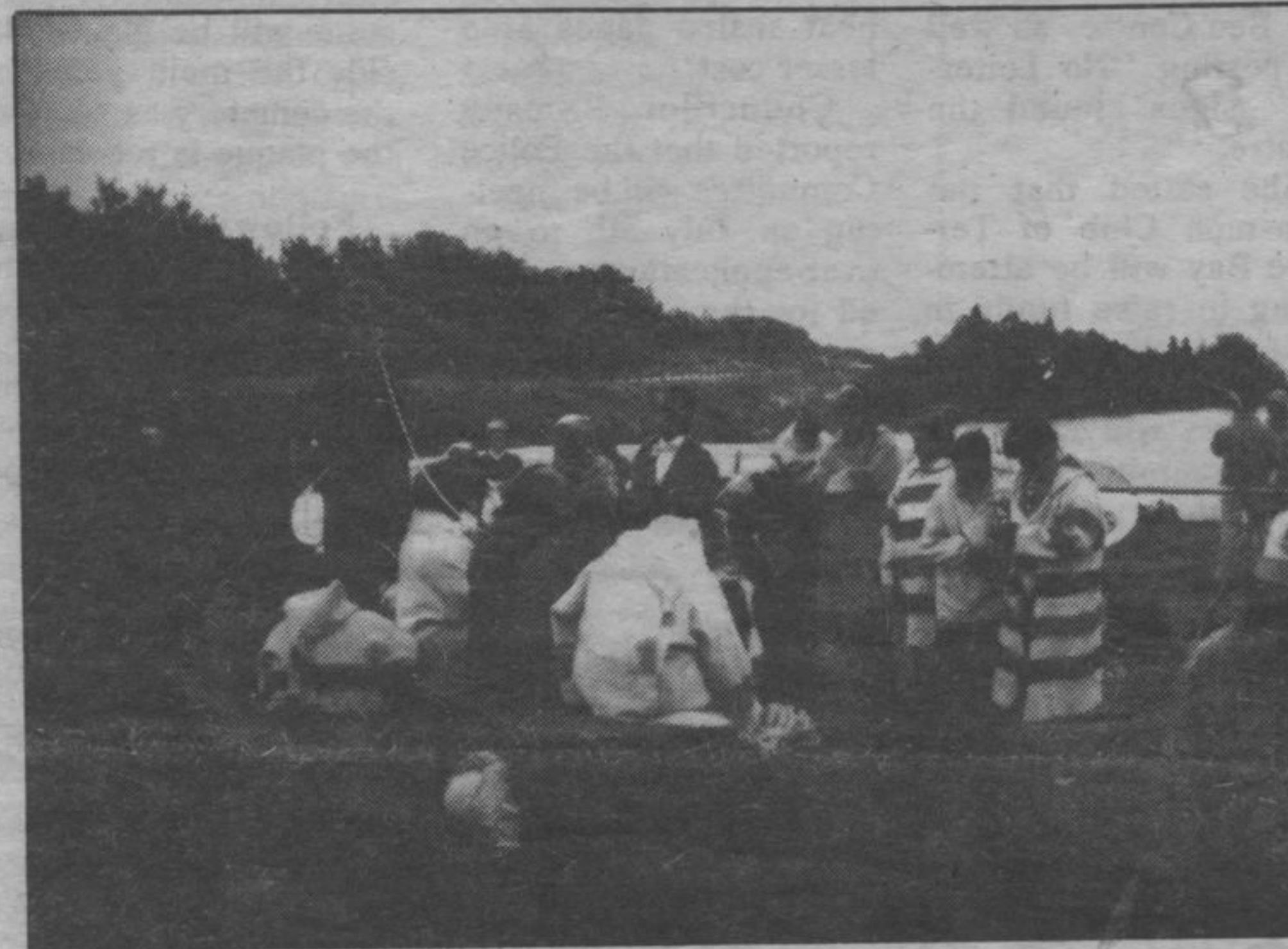
Route instruction is given to Voyageurs prior to their leaving RosSPORT.