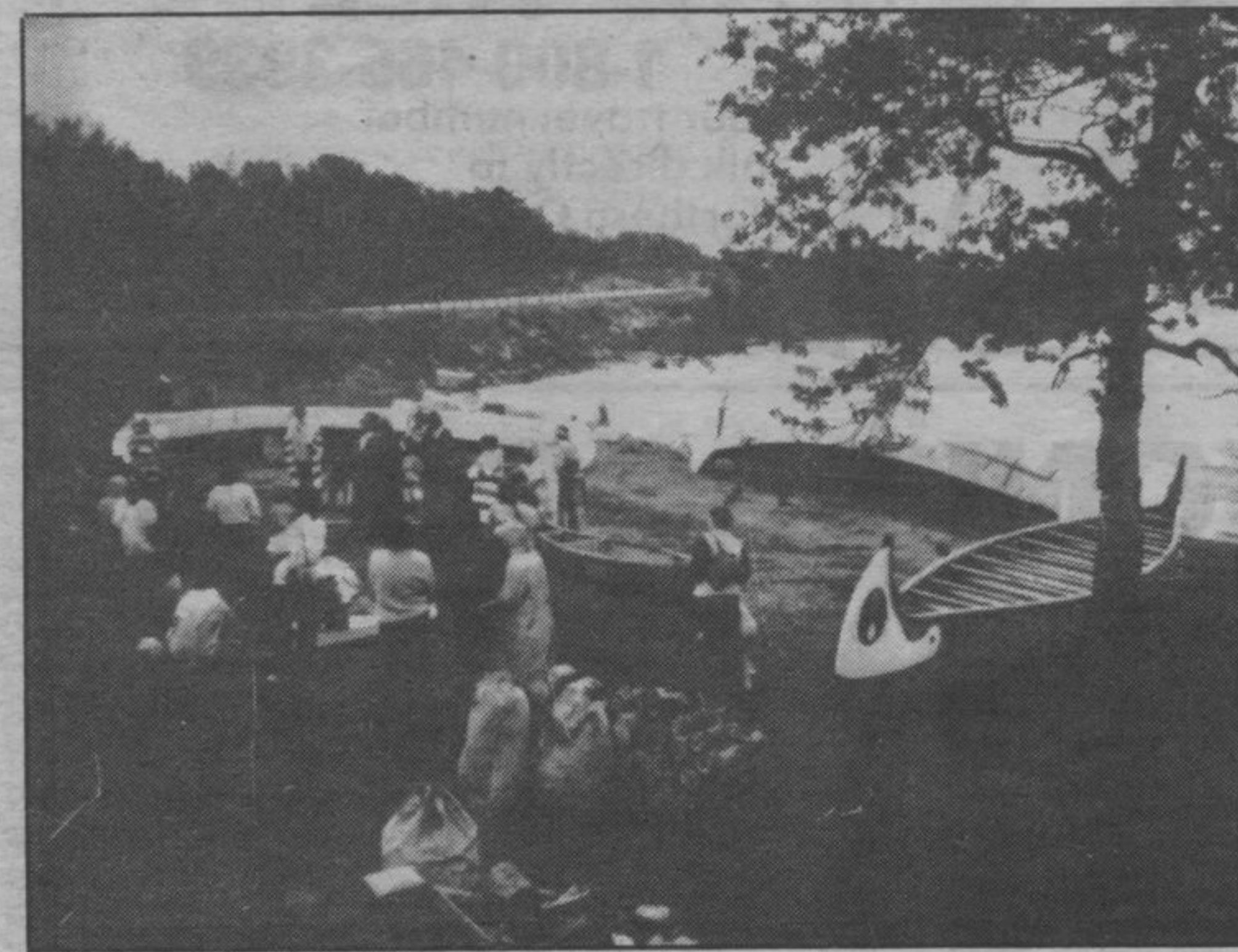
Setting up camp at Wardrope park.