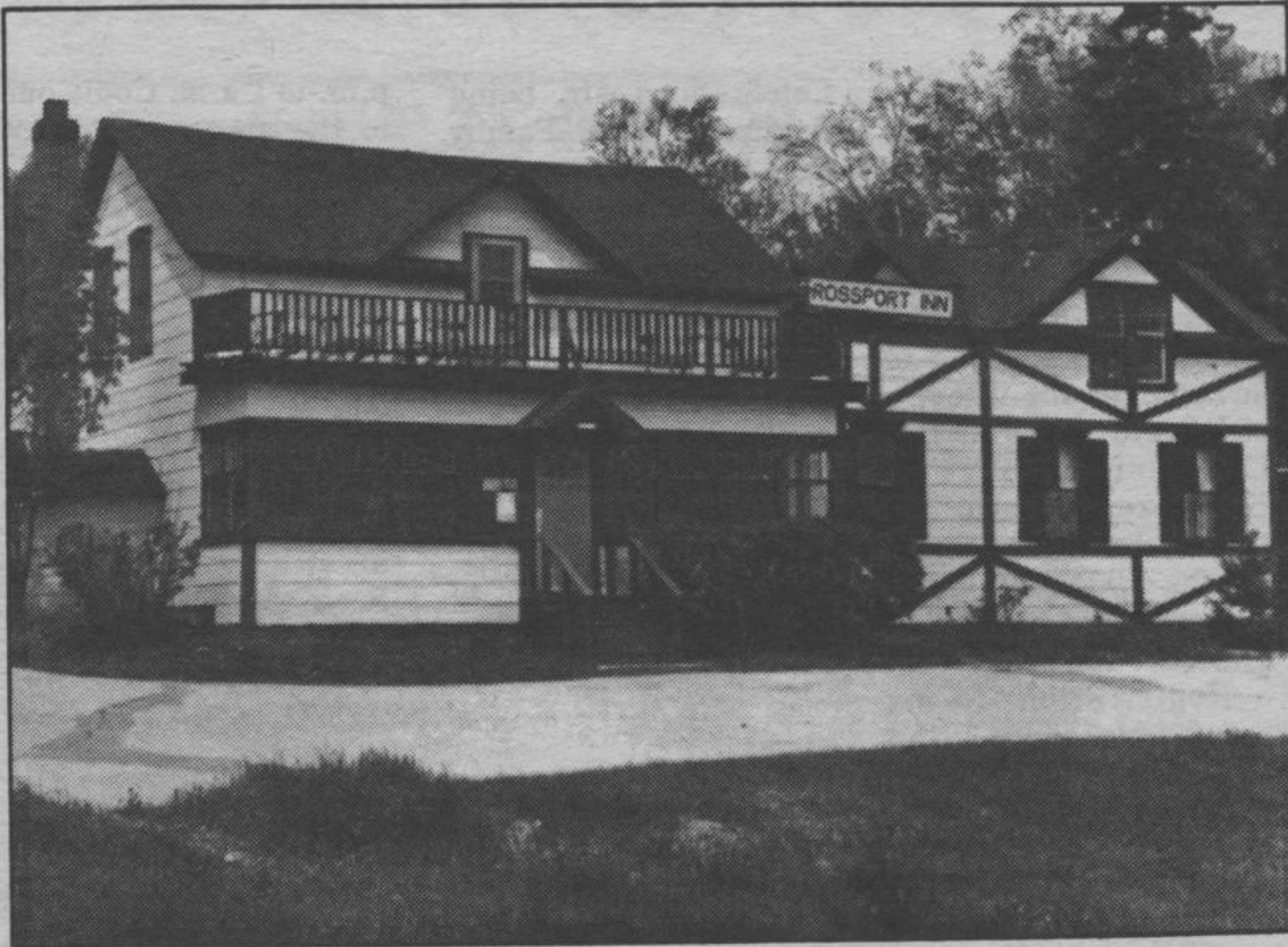
The RosSPORT Inn, as it stands today.