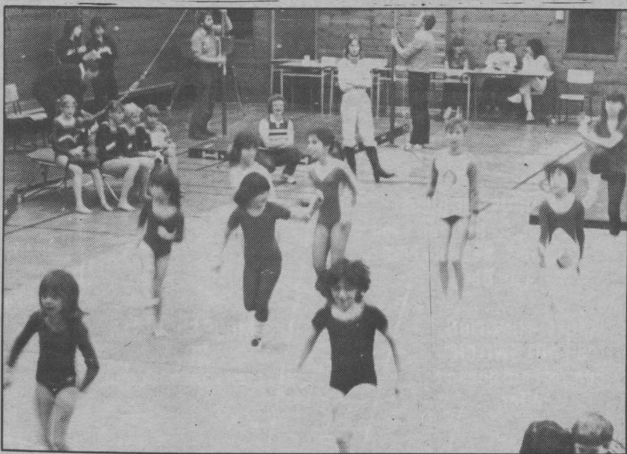
I'll tumble for ya! Recreational gymnasts and Kindergym participants perform during break at weekend Gym Meet.

The fee includes a professional hockey school jersey, a hot dog feed with the presentation of awards, crests, group pictures, certificates and evaluations plus on and off ice test results. Most of the parents attend the final game on Saturday and have the opportunity to discuss their boy's progress