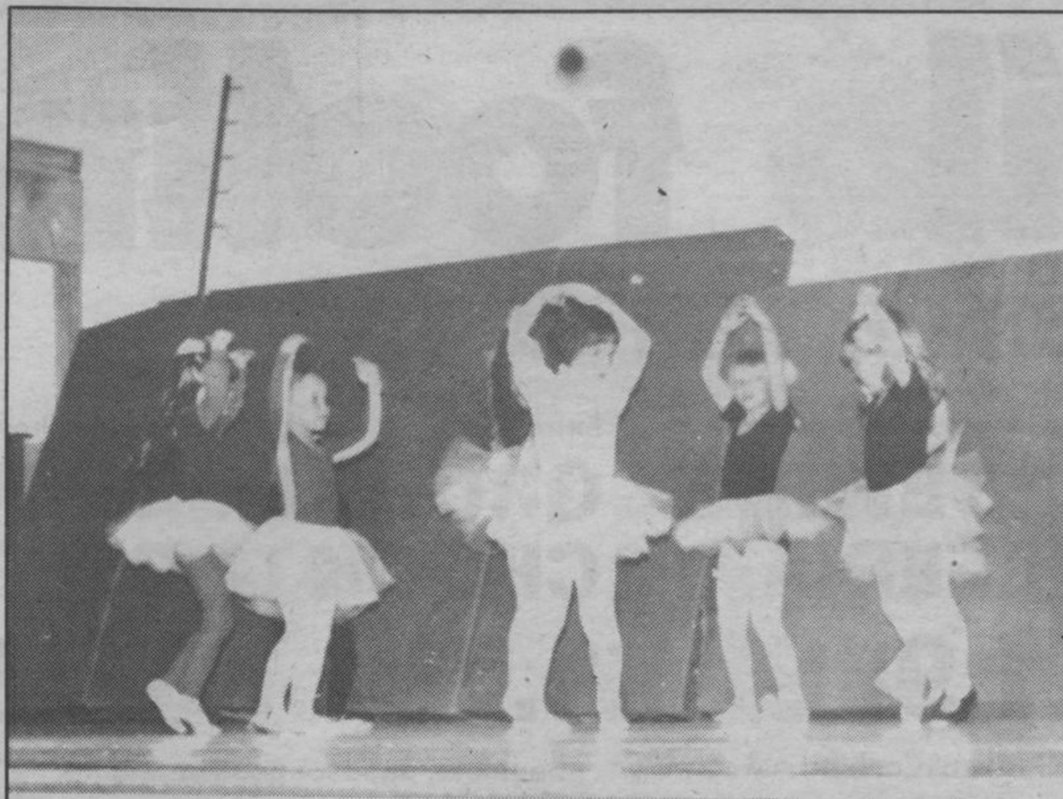
Their hard work paid off! Some of the Dancers at the Jazz and Ballet Dance Recital March 27 perform a ballet to "Music Box Dancer" for their families.