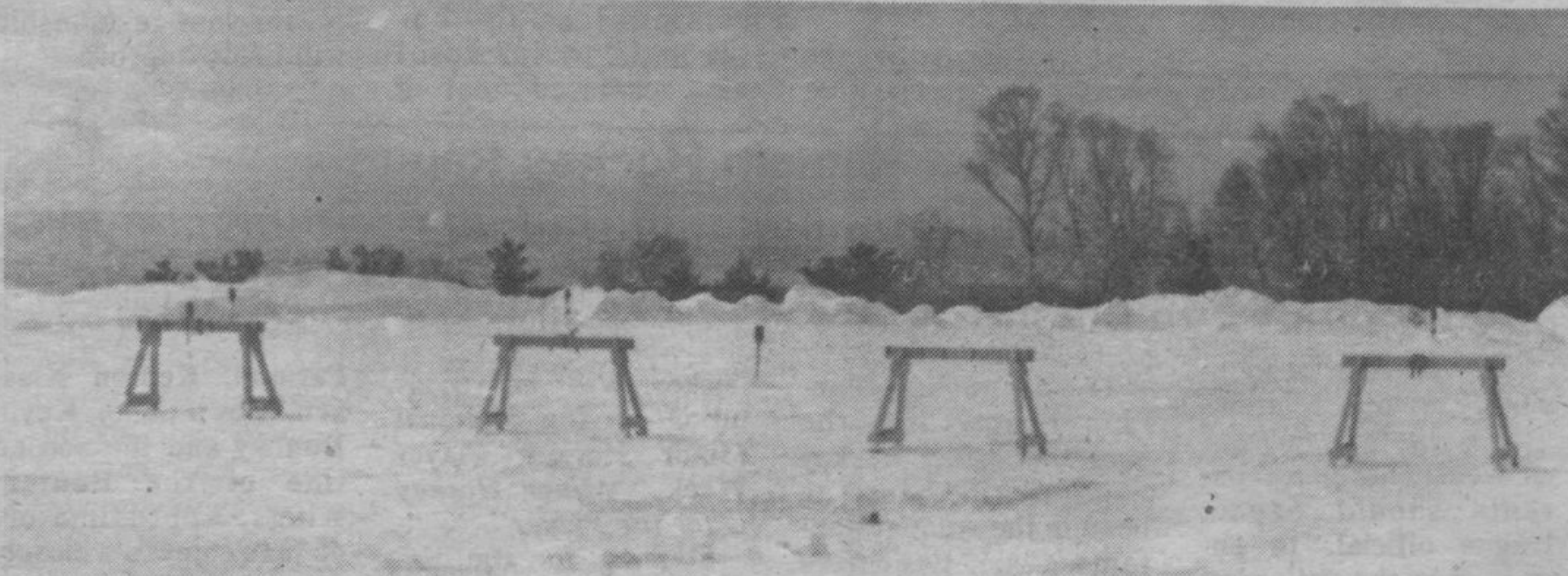
If you're in this area with your snowmobiles you have better be prepared to suffer the consequences if you are caught by the police.