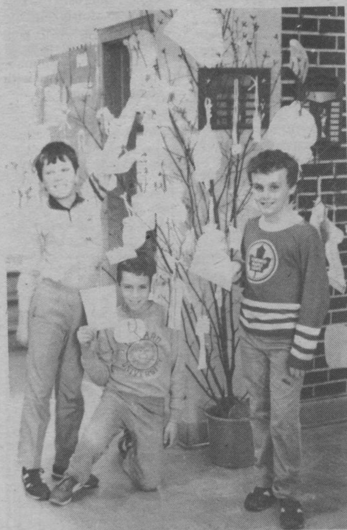
Students from Grades four, five and six researched the Old Testament and then designed symbols representing those figures and placed them on the Waiting Tree.

Protect your poinsettia from frost in the fall and place the plant in a sunny window. After October 1st, keep the poinsettia from artificial light at night and it should be brightly coloured by Christmas.