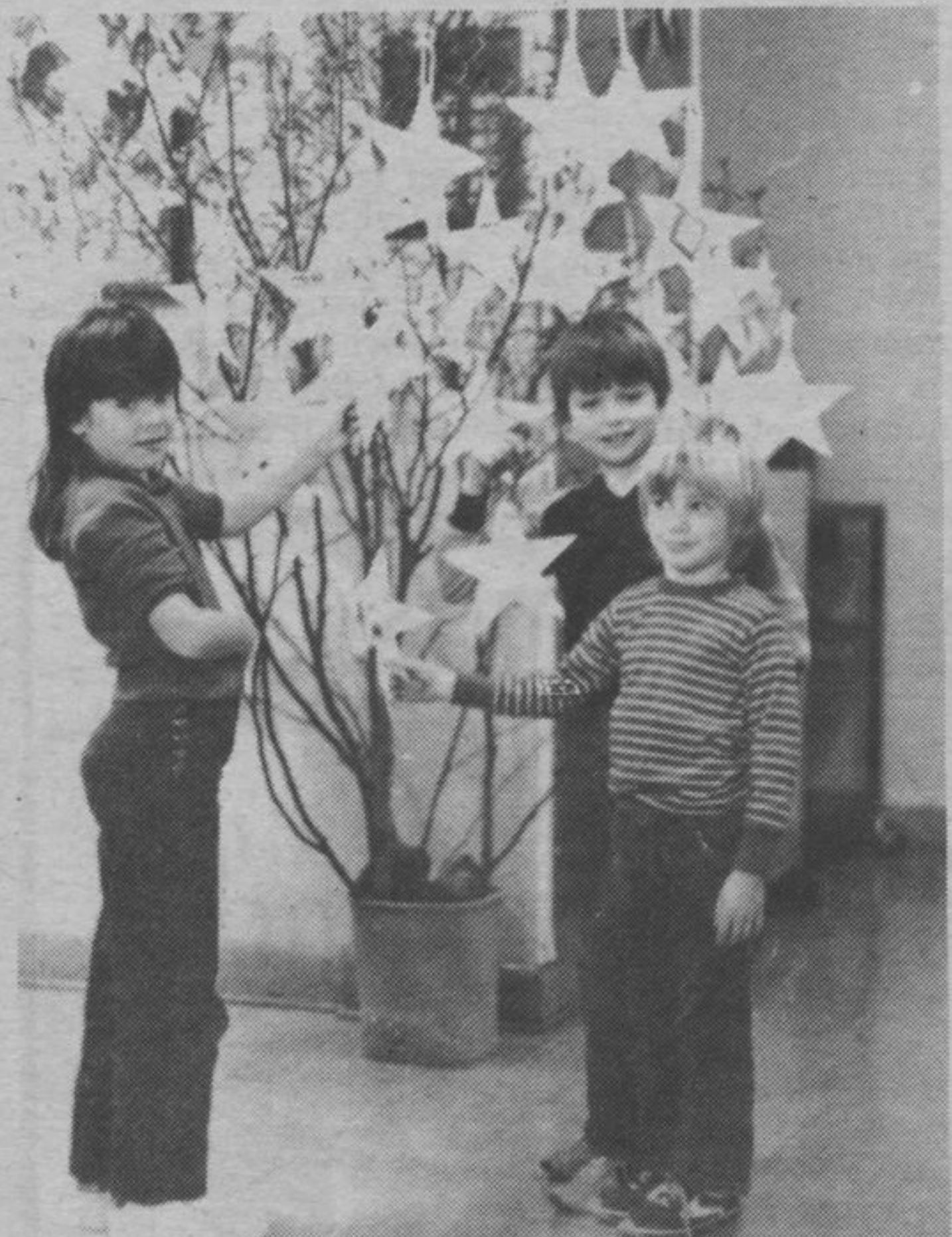
Children from Grades kindergarten to three decorated five point stars with pictures of the things for which they wait.