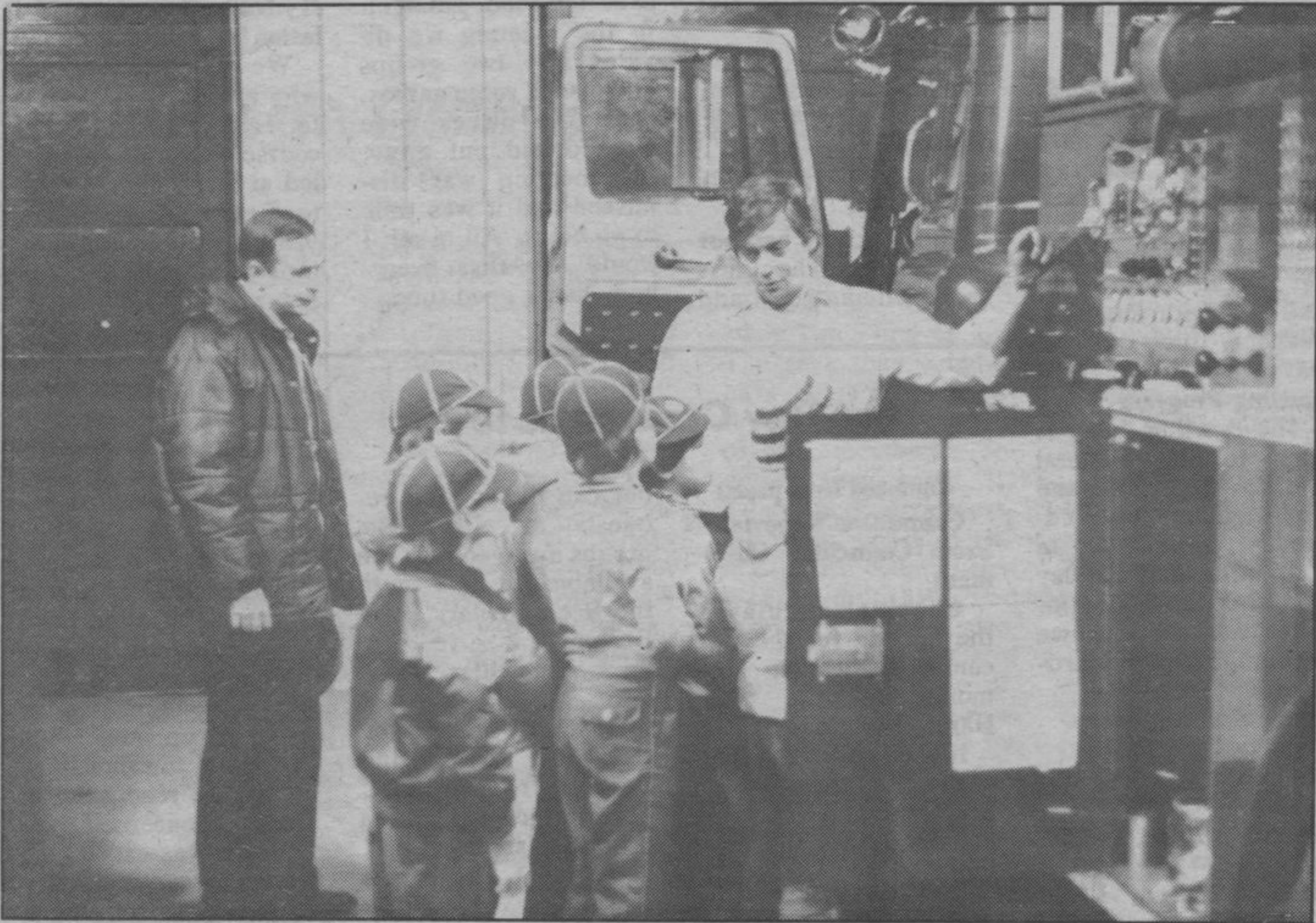
The Terrace Bay Volunteer Fire Department played host to over 20 Cubs who were at the Fire Hall to take a tour of the facilities and to find out just how the firemen