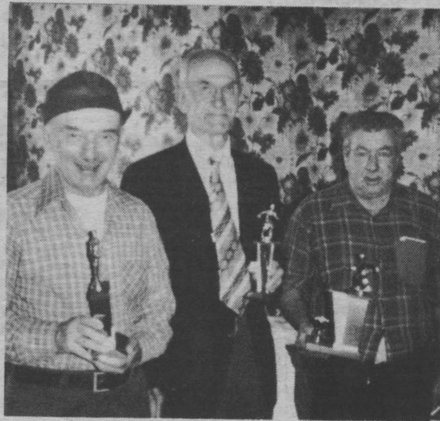
Residents of Birchwood Terrace are seen here holding their coveted bowling trophies.