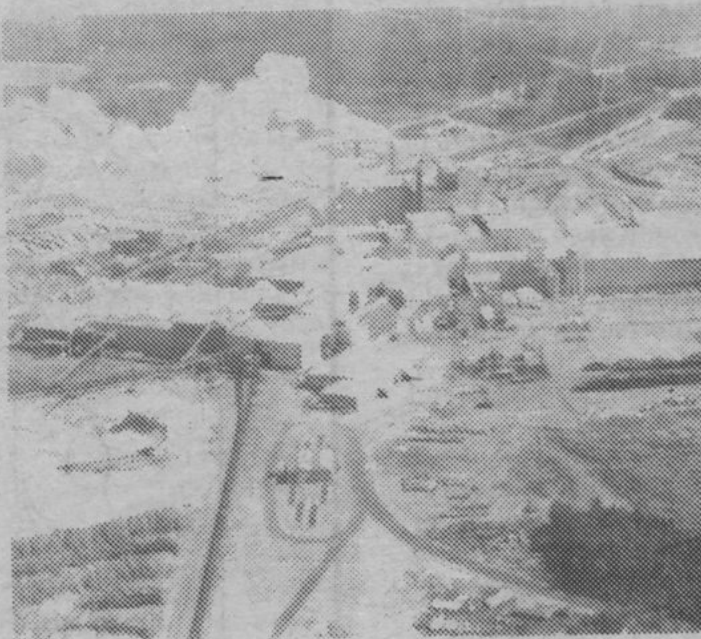
A fascinating view of Kimberly Clark via aircraft.