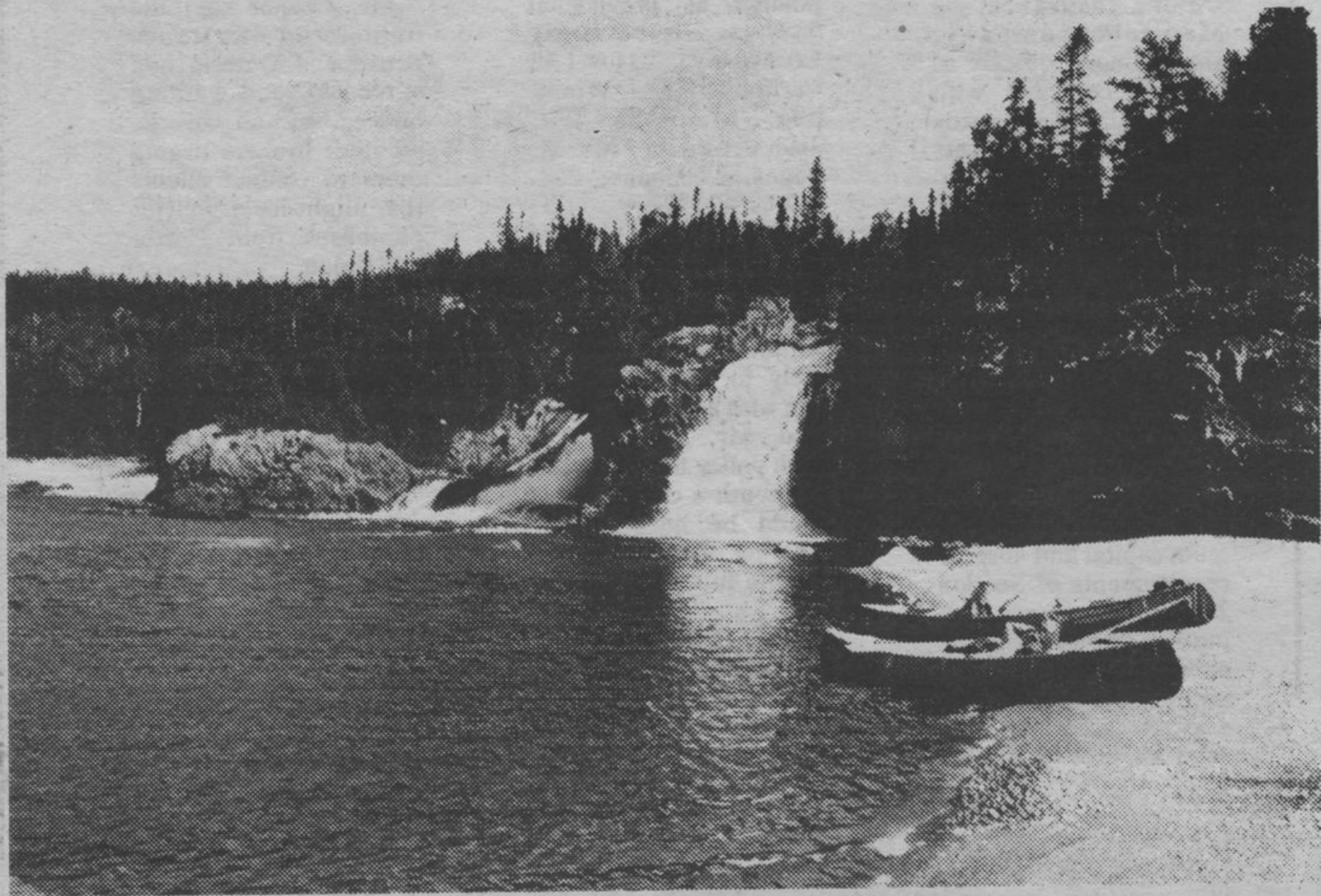
Cascade Falls entering Lake Superior.

For more information, please call the park office at 229-0801.