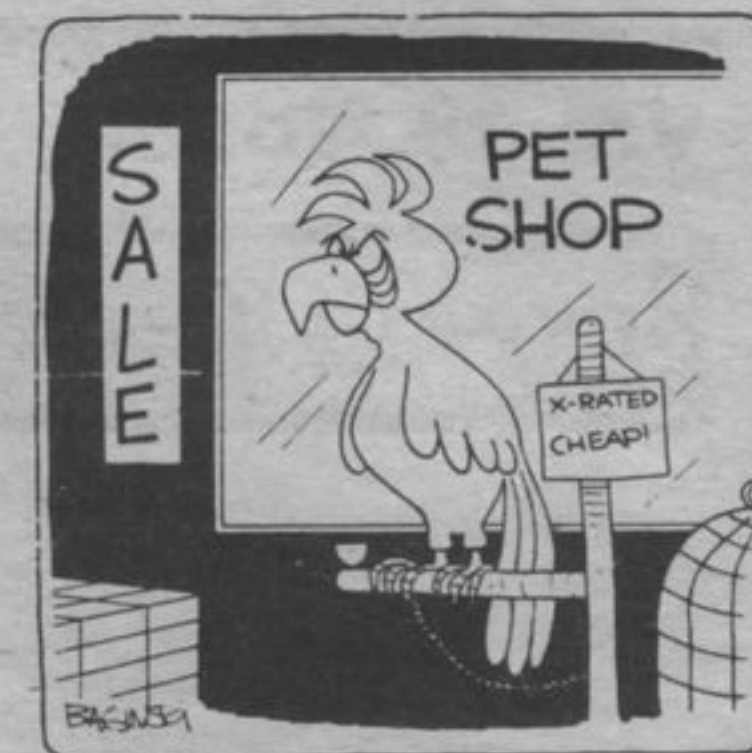
A CLASSIFIED AD WILL MOVE IT QUICKLY

There are many beneficial aspects of bugs too. Here are just a few. Their larval stage provide a large portion of the food that gives rise to trout, pickerel and many edible sportfish. They're a critical component of almost all stream, river, lake and wetland ecosystems. Their high protein content necessitates the rapid growth of nearly all our nesting birds. Economic benefits from the production and sales of repellents and ointments are substantial. Next time a bug taps you for a donation, try to console yourself with any or all of the above!