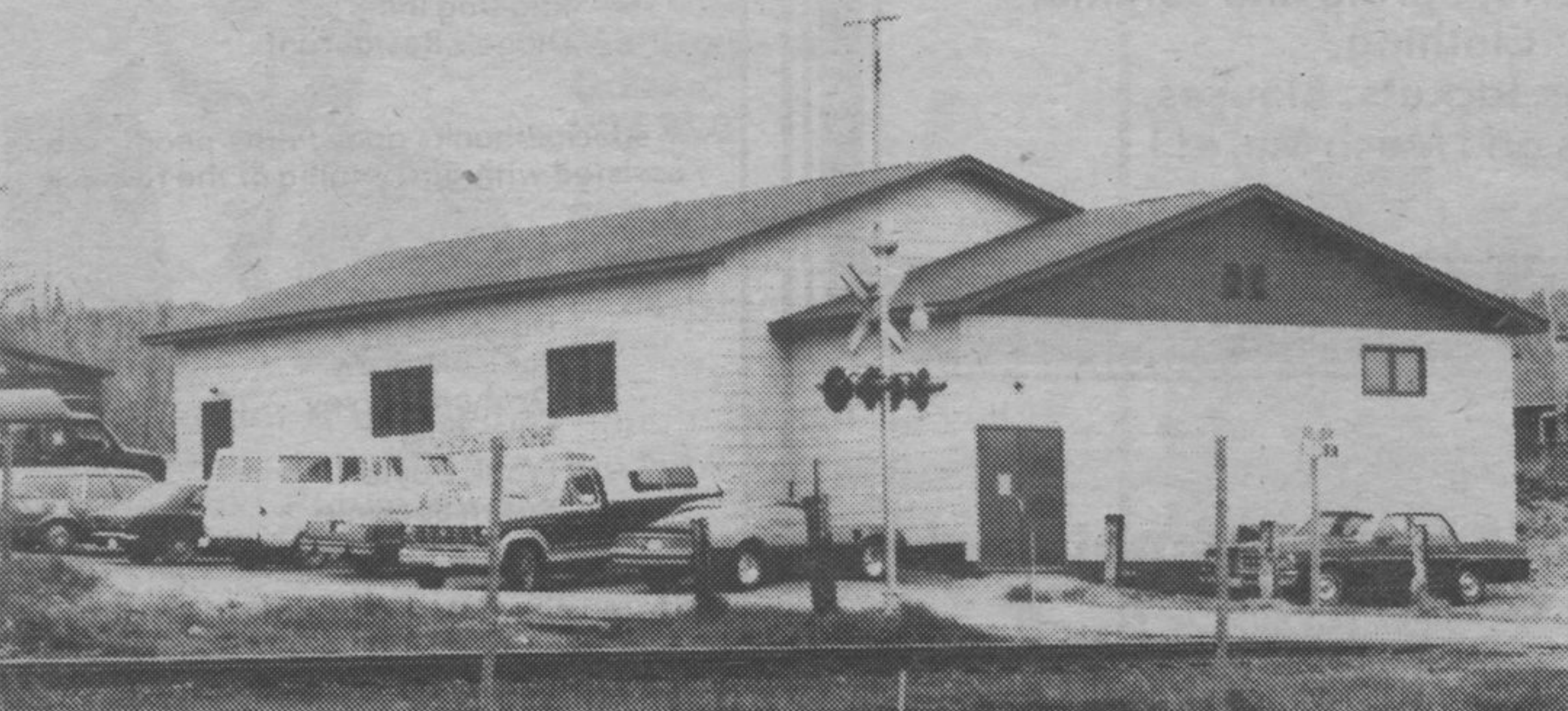
The newly renovated Rosspport Community Hall.