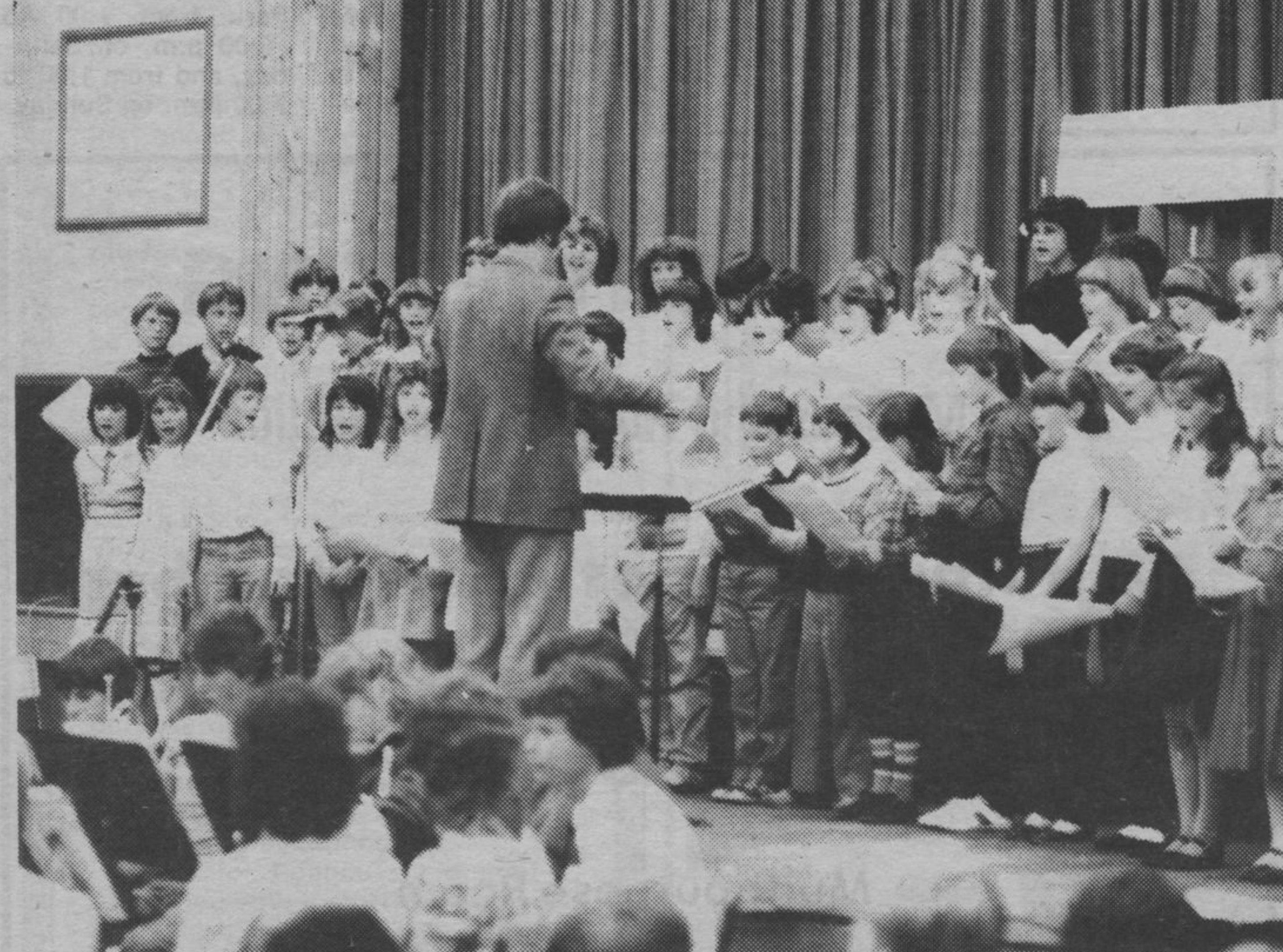
Elementary school children from Manitowadge, Marathon, Schreiber and Terrace Bay gathered at the Terrace Bay Campus of Lake Superior High School last

The proposed changes have been submitted to the Ministry of Education and the Board is now awaiting word on the Minister's approval of the changes.