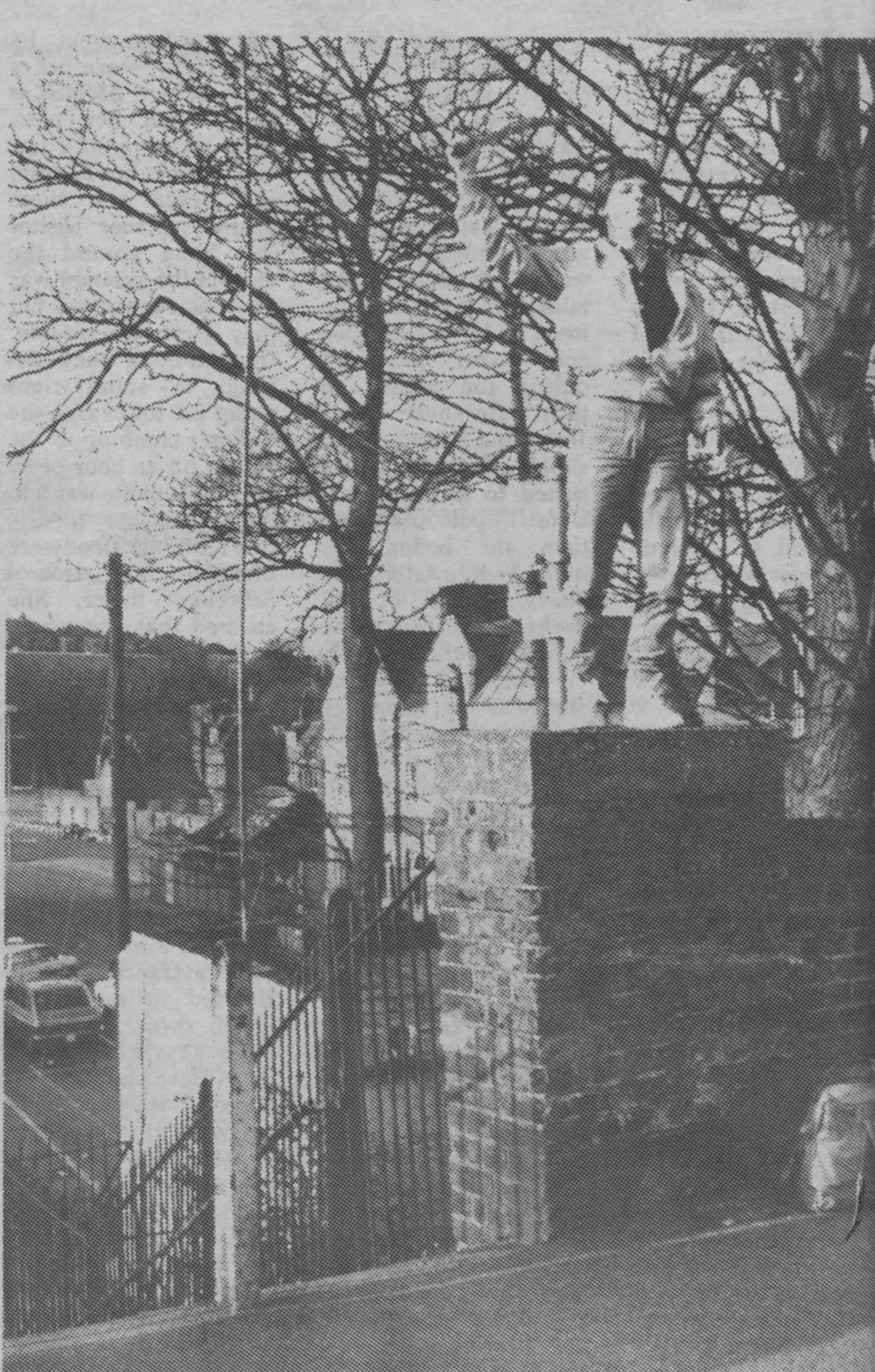
"TOURIST PICTURE!" Brent Bertin clowns around at Dover Station, as the group waits for the train to take them back to London.