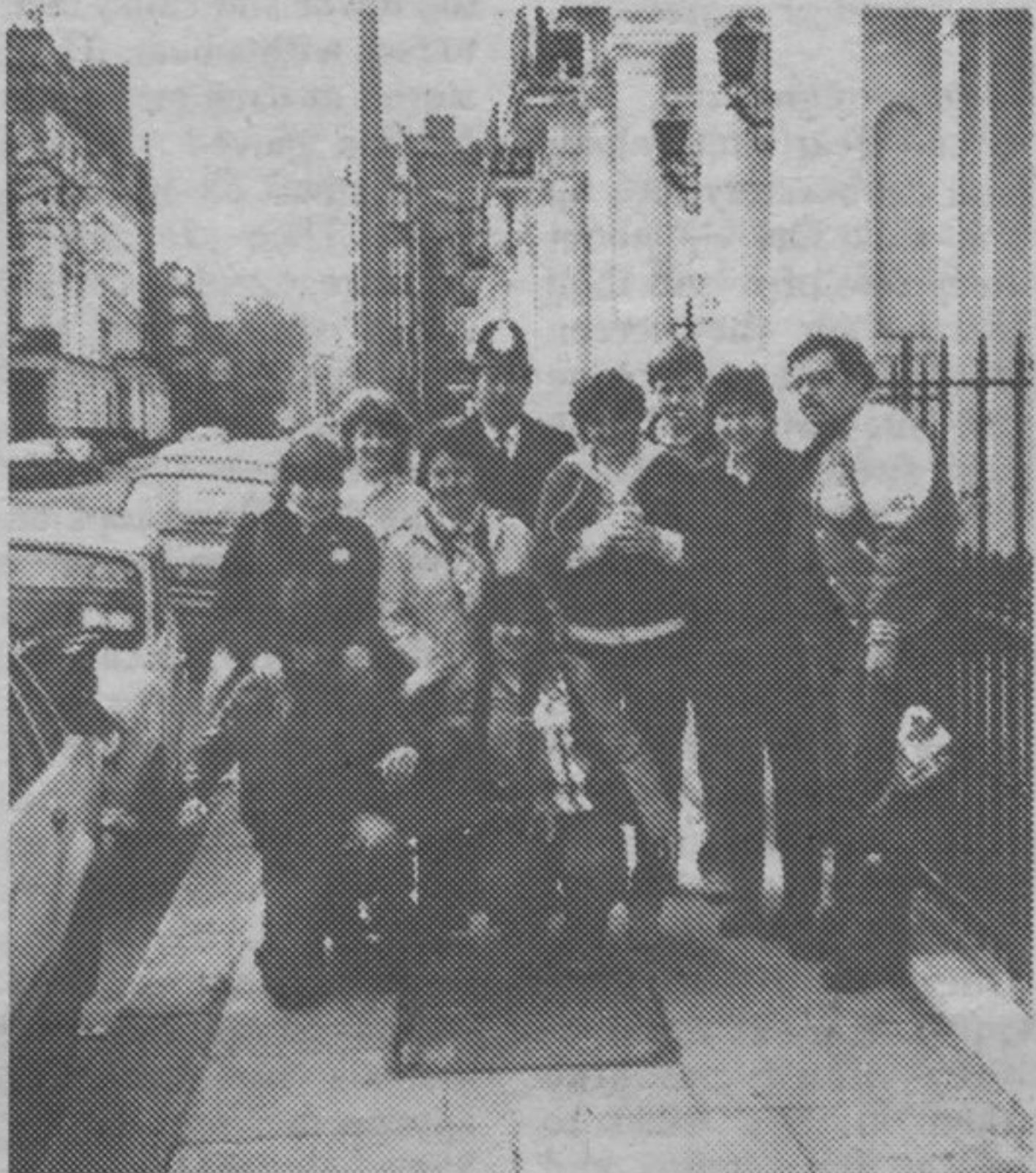
Part of the group poses with a Bobby outside of their hotel.