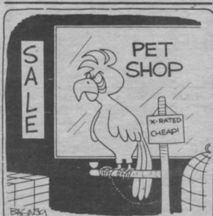
A CLASSIFIED AD WILL MOVE IT QUICKLY