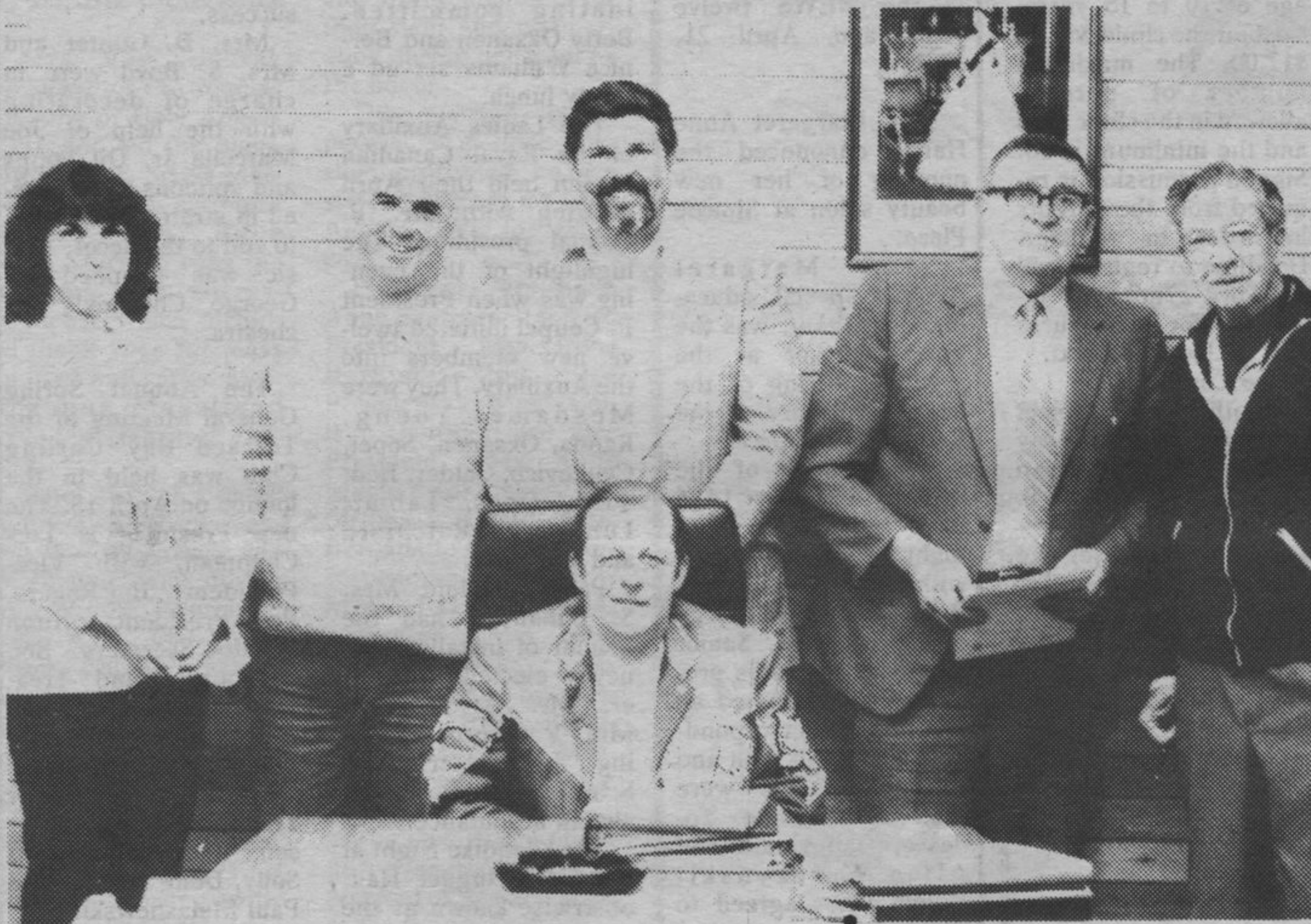
Terrace Bay's Official Plan has been prepared and submitted for final approval by the Minister of Housing and Municipal Affairs in Toronto. The Plan was prepared by the Planning Board. The Board members are,

Use credit wisely, purchasing only things which are necessary. Credit carries a price. It can be a convenience or quicksand for shoppers.