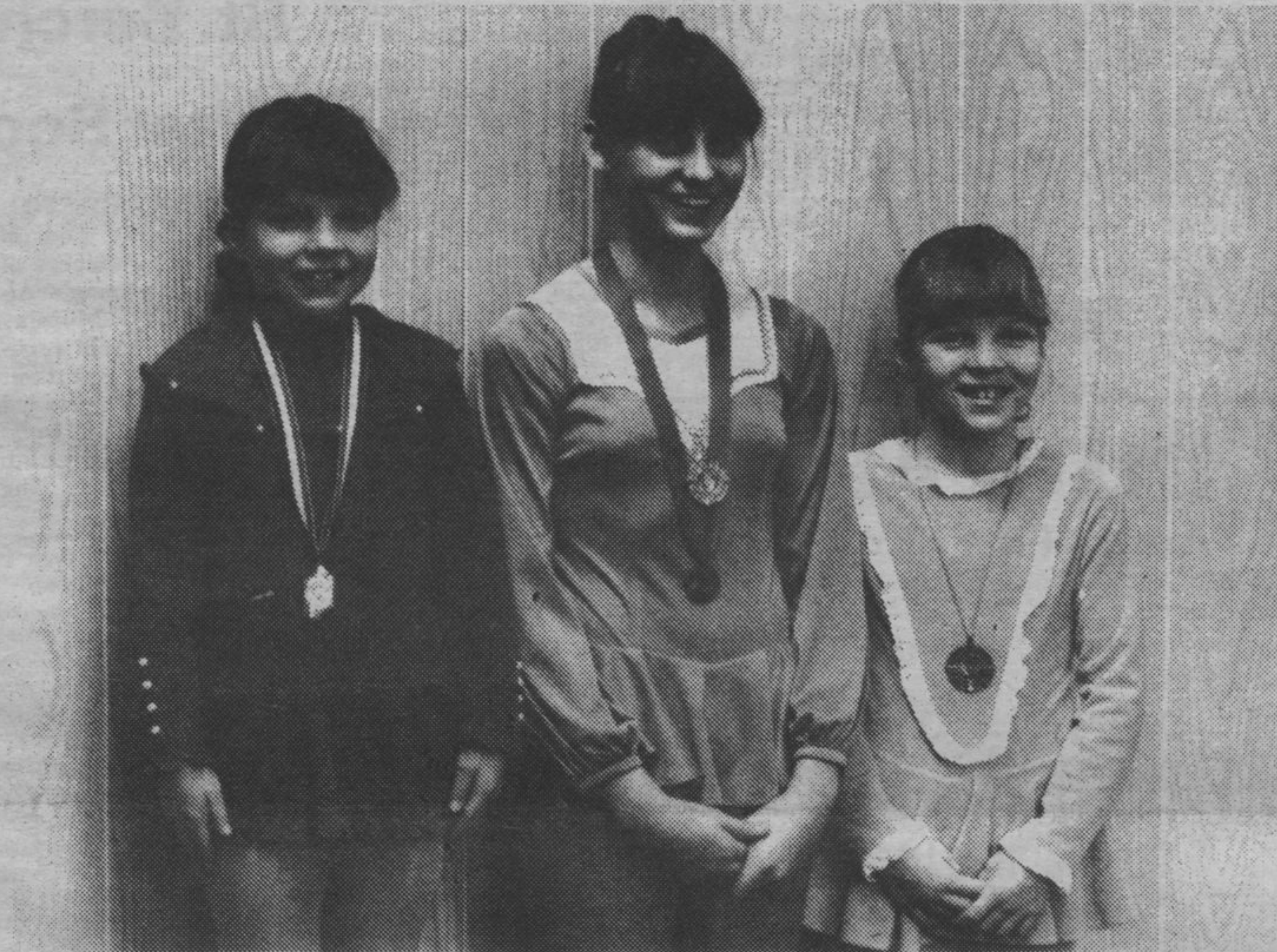
Thunder Bay Open Figure Skating Championships.