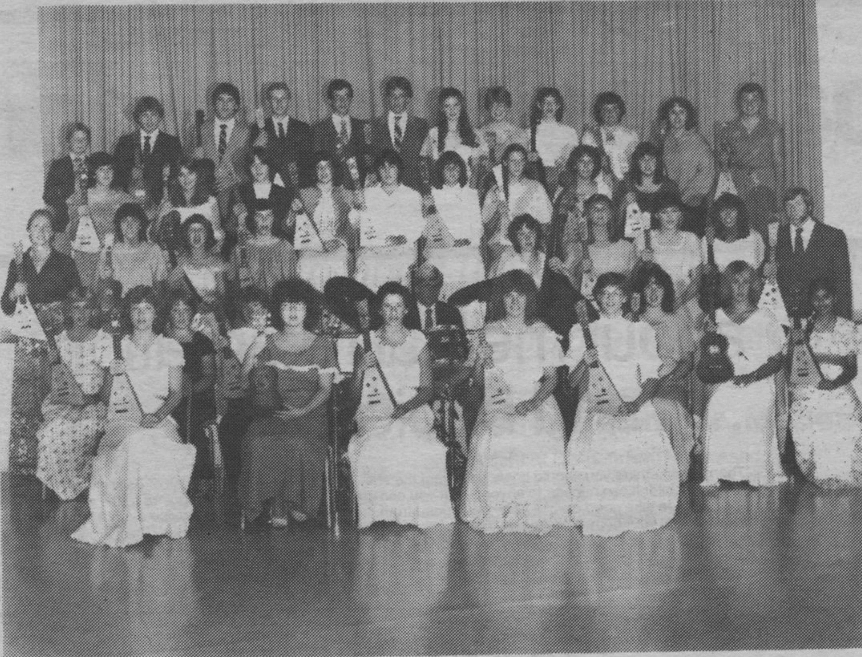
The Halifax Ukulele Band on Tour.

[Editor's note: It was announced Friday that a tentative memorandum of agreement has been signed between American Can and the James River Corp. for the sale of the Marathon Mill. Buchanan Forest Products will hold 20% of the operation.]