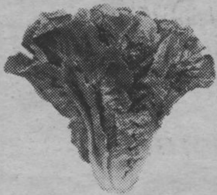
Romaine LETTUCE 59¢ each