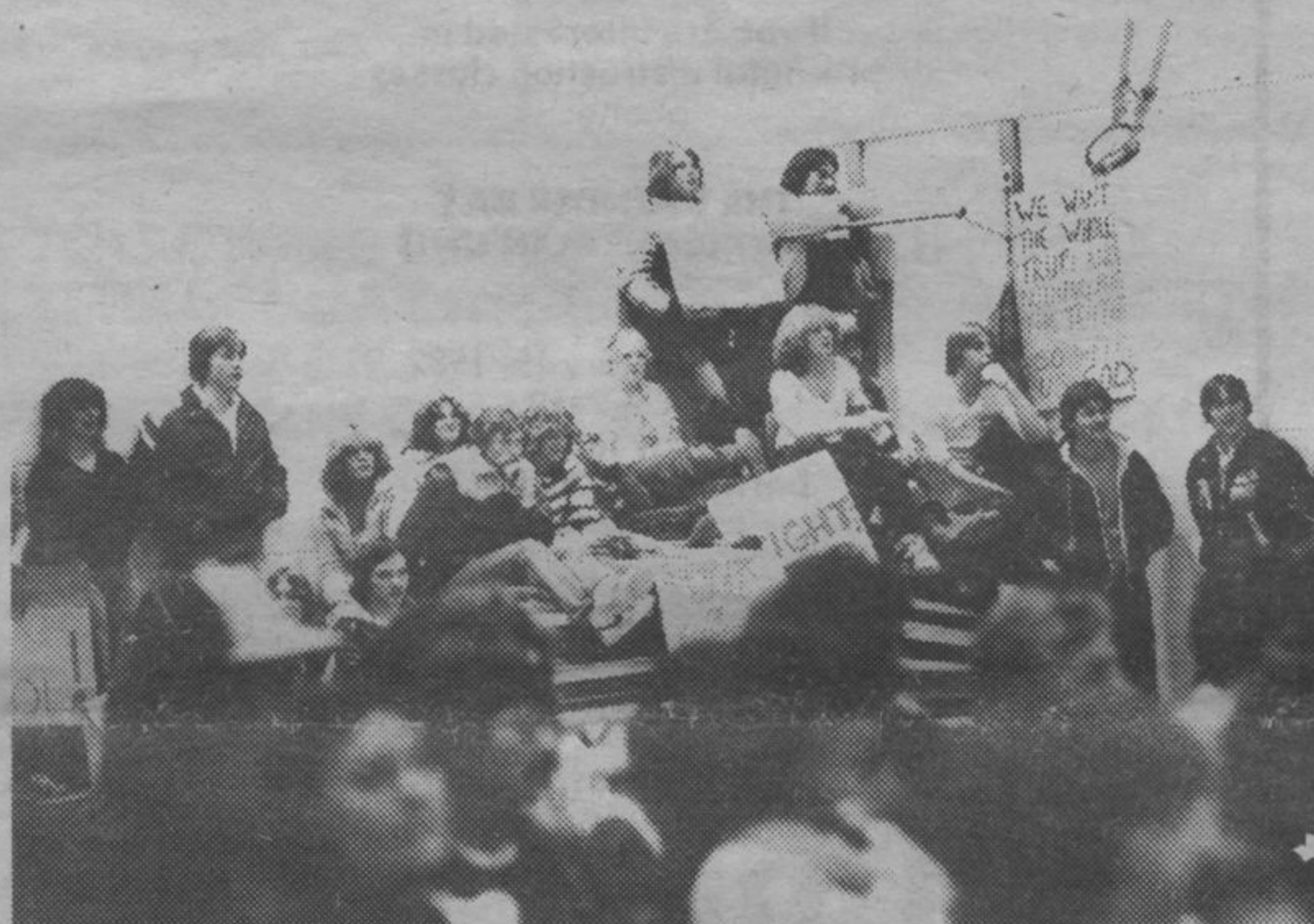
The students of Lake Superior High School react with protests.