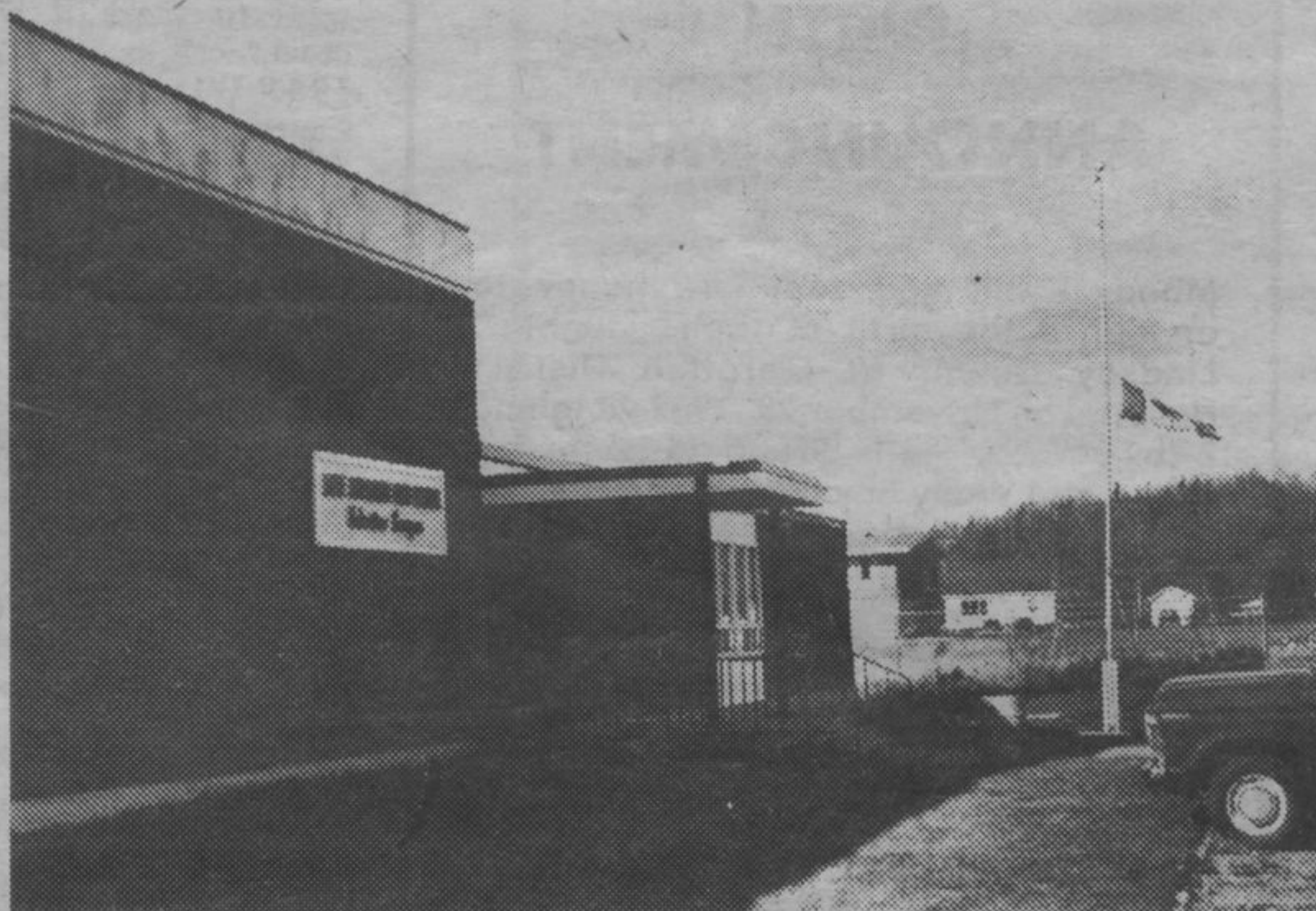
The School Board votes to close the Schreiber Campus