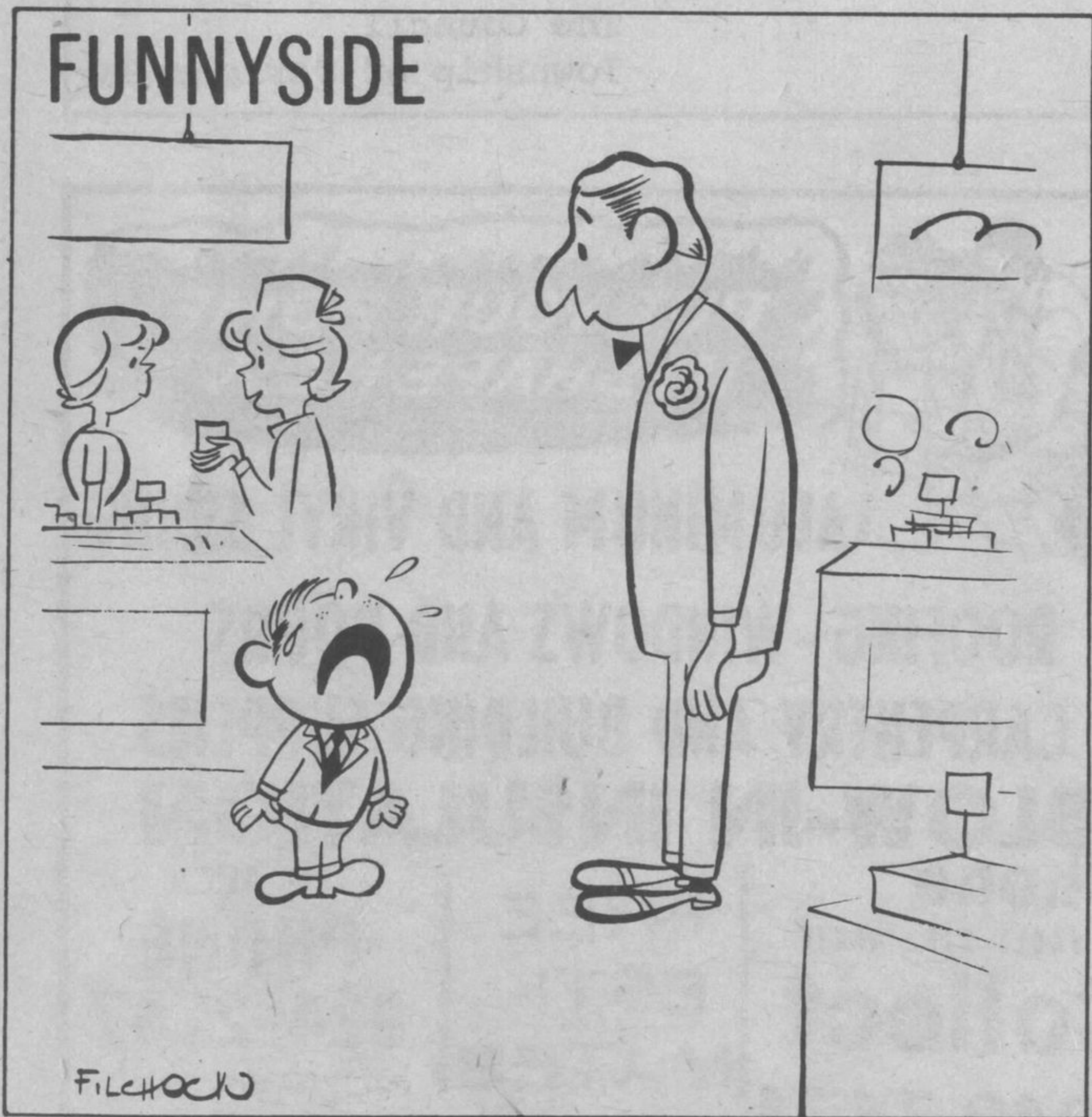
"I didn't lose my mommy - I lost my credit card!"